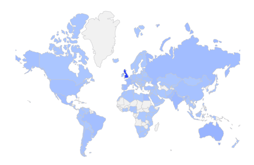
Figure 1: Map showing participant location for MOOC (NB: shading indicates global joiner rates, FutureLearn does not provide a key).