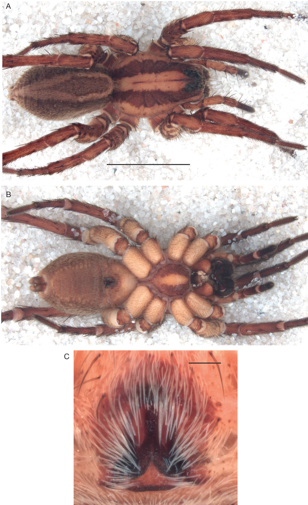
FIG. 2. — Neotype of Lycosa accentuata Latreille, 1817 (junior subjective synonym of Araneus trabalis Clerck, 1757) from forêt de Fontainebleau near Paris: A, dorsal view; B, ventral view; C, epigyne in situ . Scale bars: A, B, 5 mm; C, 0.2 mm.