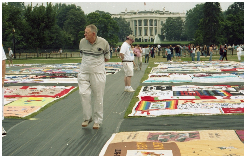
Figure 4. Cleve Jones, NAMES Project AIDS Memorial Quilt, started in 1987, pictured in Washington, D.C. June 26, 2004. Licensed under CC BY 2.0.