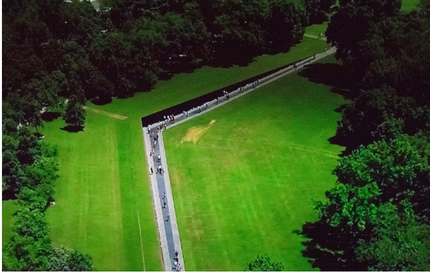
Figure 5. Maya Lin, Vietnam Veterans Memorial , 1982, Washington, D.C. Photo by Ron Cogswell. December 28, 2017. Licensed under CC BY 2.0.