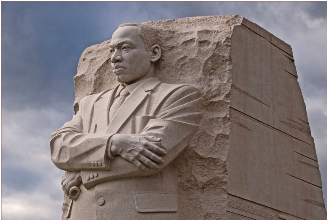
Figure 1. Lei Yixin, Martin Luther King, Jr. Memorial, 2011, Washington, D.C.

The growing debate over blatantly racist figures like Jefferson Davis and Robert E. Lee has shown, however, the model of monumentalizing any figure brings with it certain limitations. Even when depicting non-white individuals, monuments to historic “heroes” can still white-wash and regulate history to continue to serve the interest of those with existing power. The Martin Luther King, Jr. Memorial (see Figure 1) in Washington D.C., the first memorial honoring an African American on the National Mall, represents another complication in producing monumentalized statues of individuals. Both in Savannah and in Washington, the impetus for creating monuments to Black people in America came from a call for diversity in the commemorative landscape; the historically Black fraternity Alpha Phi Alpha, of which King himself was a member, had to lobby Congress for several years before President Clinton signed an act authorizing the construction of the memorial in 1996. 4 In 2011, the memorial was finally unveiled.