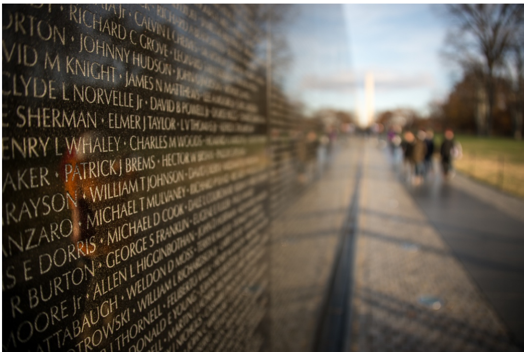
Figure 3. Maya Lin, Vietnam Veterans Memorial, 1982, Washington, D.C. November 28, 2014. Licensed under CC BY 2.0.