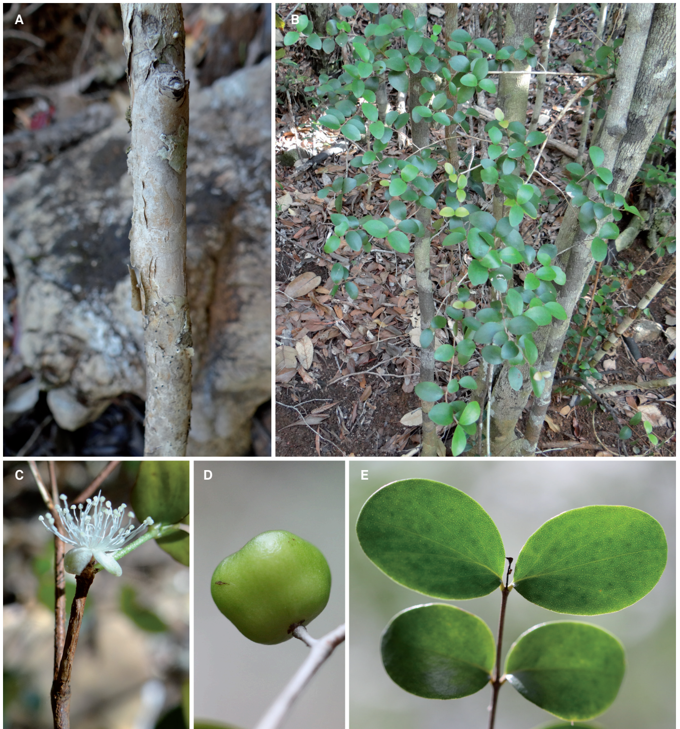
Fig. 1. – Eugenia plurinervis N. Snow, Munzinger & Callm. A. Main stem with peeling grayish bark; B. General habit; C. Flower; D. Immature fruit; E. Radiating secondary nerves of the densely punctate leaves.