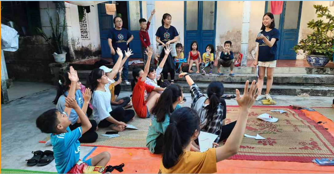
Youth project members in Vietnam held a quiz for local children on the topic of bacteria and antibiotics