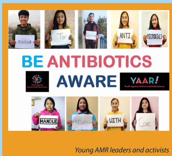
Young AMR leaders and activists

This concise framework identifies key learning outcomes appropriate to different age groups that are applicable across a diverse range of settings and learning environments. It can be used as a tool for structuring curricula and learning activities. It is aimed at teachers, educators, research scientists and informal learning providers. Reference to associated curricula material for each age group, details on how to apply the framework, a glossary and links to other resources is outlined in the full version of the AMR Learning Framework .