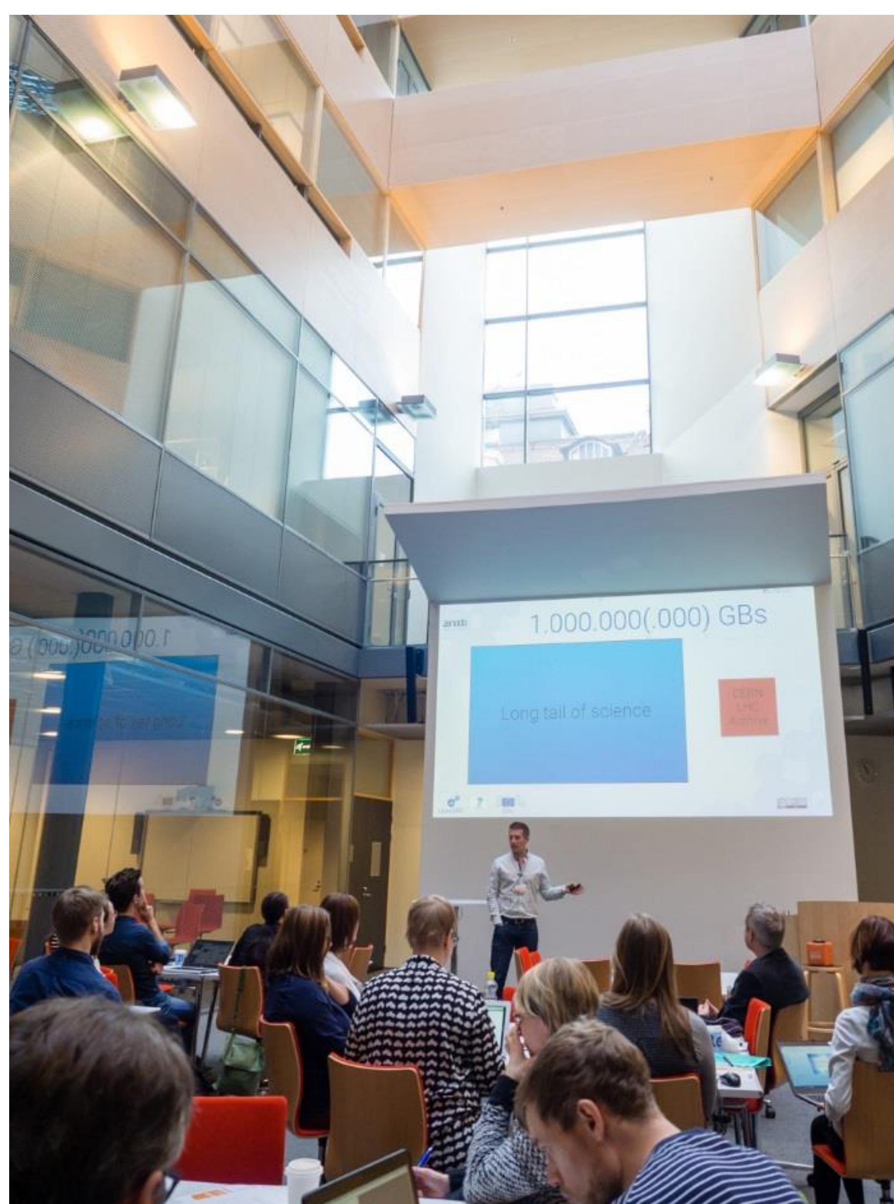
Open Science Workshop 20.10.2015