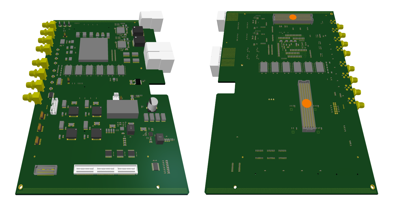
Figure 2. PCB front and back view of the proposed HPDPU.

vices is set to 16 bit databus. Again, to protect the data against radiation effects, redundancy concepts are exploited. For the data memory this is implemented on the signal processing level, taking state-of-the-art error correction measures into account. In detail, Reed Solomon codes RS(12,8) are applied to increase the reliability against SEU and SEFI.