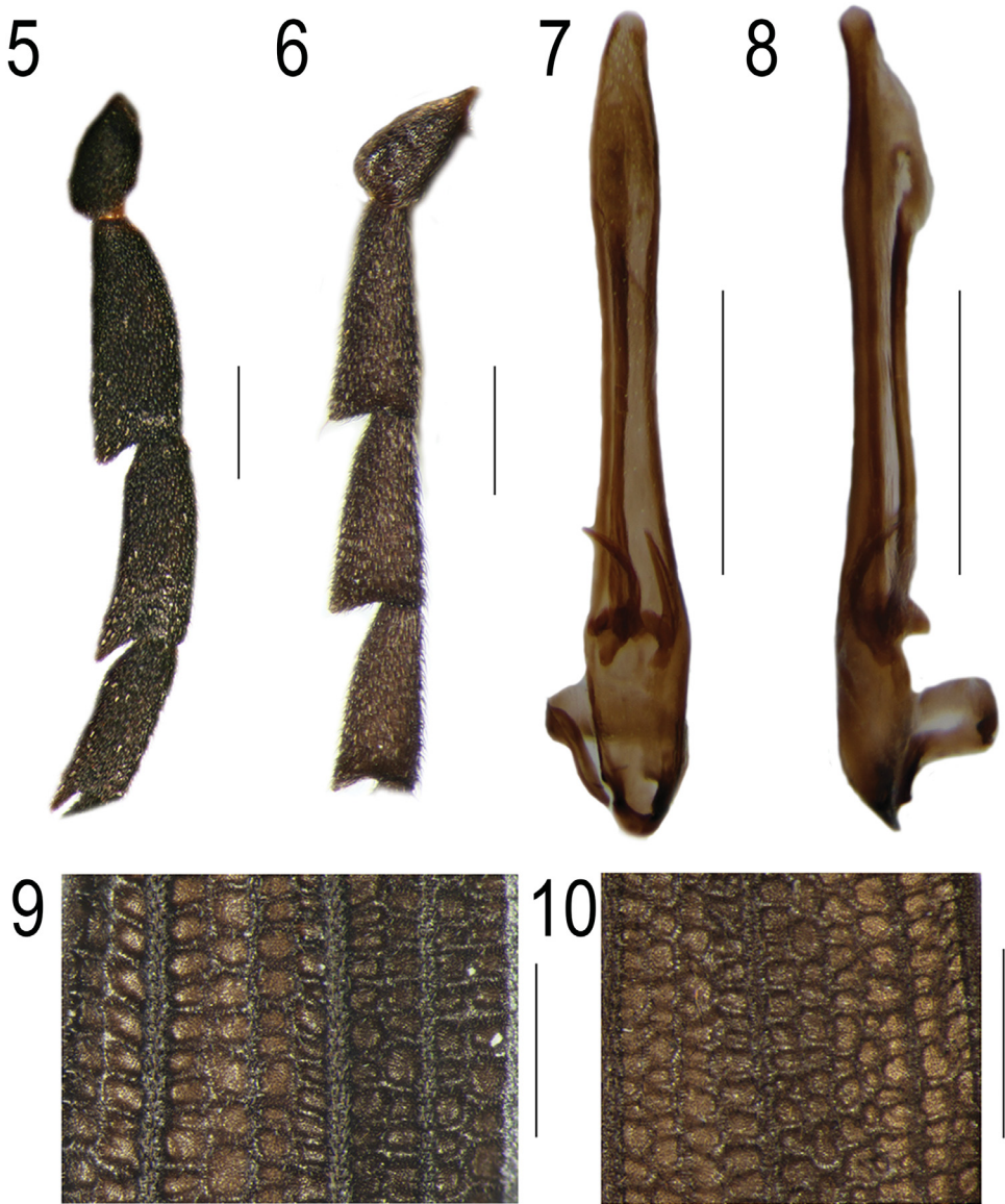
Figs 5–10. Synchronnus species. 5–6 – basal antennomeres (5 – S. testaceithorax ; 6 – S. etheringtoni sp. nov.). 7–8 – male genitalia of S. etheringtoni sp. nov. (7 – ventral view; 8 – lateral view). 9–10 – right elytron, the middle part in detail (9 – S. testaceithorax ; 10 – S. etheringtoni sp. nov.). Scales = 0.5 mm (Figs 5–10).