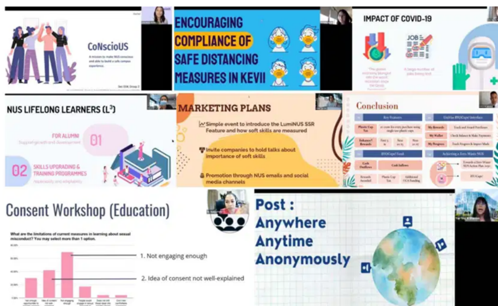
Figure 3. Collection of screenshots of students' online presentations

critical reading and writing. Hence, the emphasis on dialogic scaffolding to encourage social connections and interactivity during the online lessons was effective in creating a supportive and engaging learning experience for students.