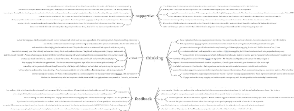
Figure 2. Sample text analysis with tree diagrams for chosen keywords

From the coding, it is found that the highest coverage of references are linked to the nodes “enhanced learning” and “thinking” - 21 references and 16 references respectively. Students reported that: