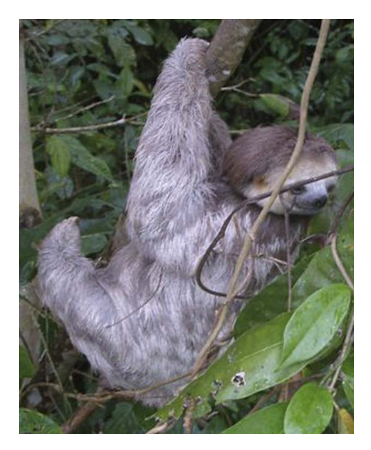
Fig. 4. —Adult female in typical arboreal habitat in Suriname showing the ability to turn the head 180°.

Bradypus tridactylus is vulnerable to cats (jaguar [ Panthera onca ] and margay [ Leopardus wiedii ]), snakes (anaconda [ Eunectes ]), and harpy eagles ( Harpia harpyja — Beebe 1926; Hoke 1987; Izor 1985). B. tridactylus is difficult to keep in captivity except where the animal is endemic (Hoke 1987). They succumb to viral infections and trace element deficiencies (Hoke 1987). Electroejaculation has been successful (Peres et al. 2008).