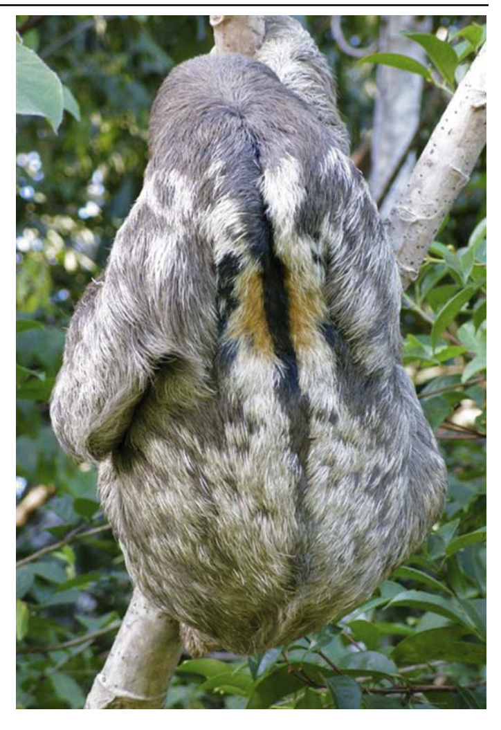
Fig. 1.—Adult male Bradypus tridactylus from Suriname showing the sex-specific dorsal speculum.