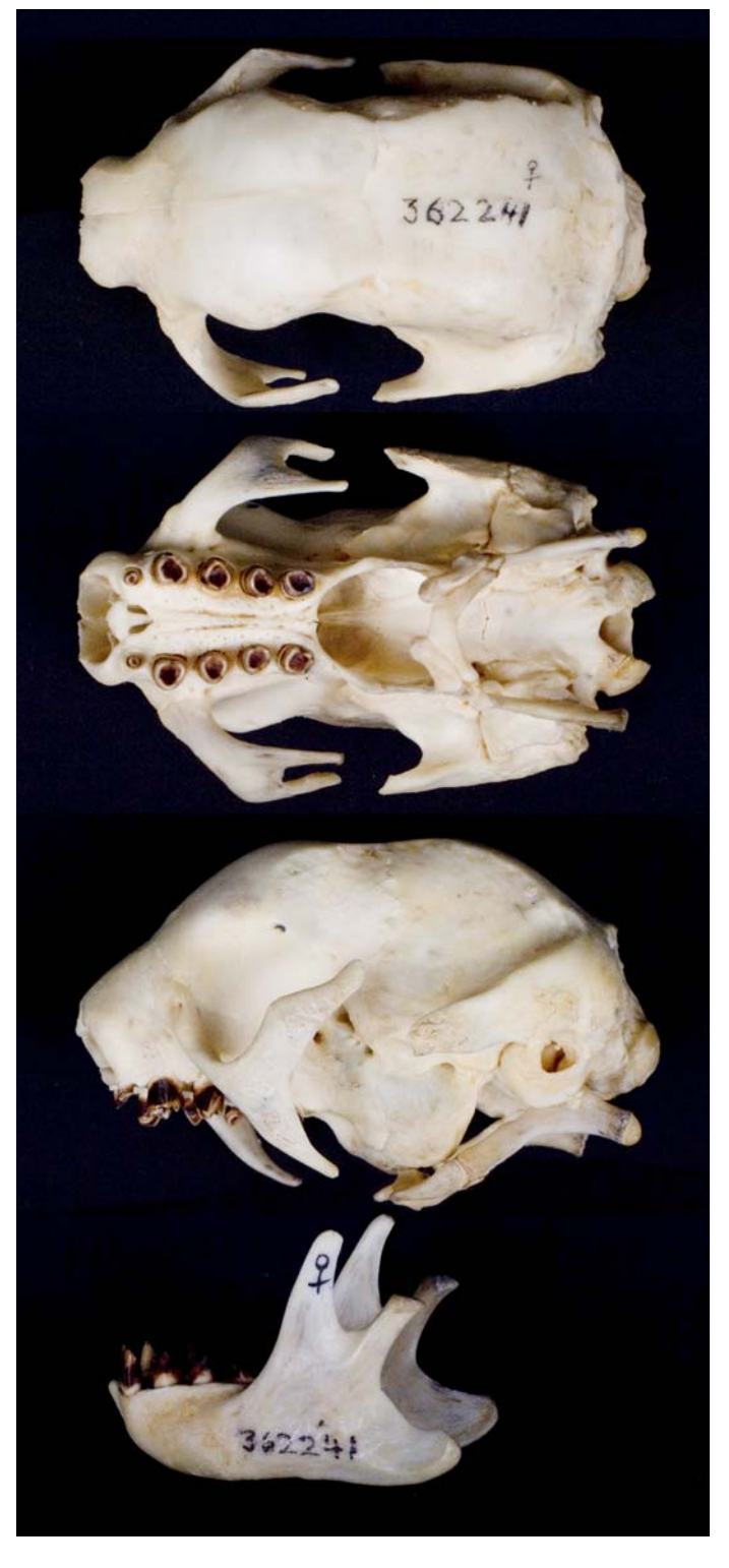
Fig. 2. —Dorsal, ventral, and lateral views of skull (with atlas attached) and lateral view of mandible of an adult female Bradypus tridactylus (United States National Museum 362241) from the upper Takutu River region of Guyana. Greatest length of skull is 69.96 mm.