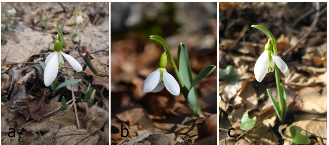
Figure 3. Species of the genus Galanthus in Serbia: a – G. nivalis [Mt. Belava, Debeli Del]; b – G. elwesii [vicinity of Piroć, Crni Vrh]; c – narrow-leaved variant of G. elwesii [Sićevo Gorge, Kusača].