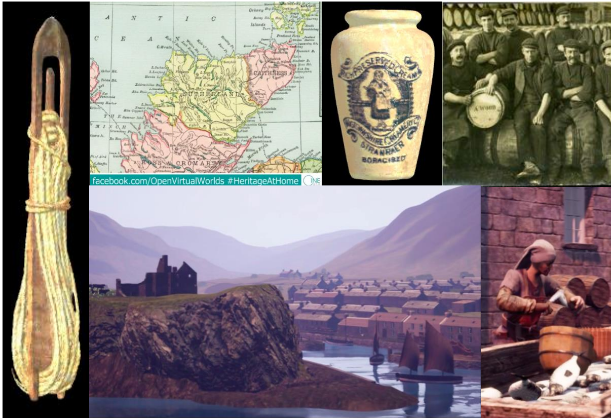
From top left: Net Mending Needle – 3D; area map from HeritageAtHome; Ceramic Cream Preserve Jar – 3D; photograph of coopers on herring barrels. Bottom row: castle ruins and town; herring ‘gutting girl’ – both from reconstruction