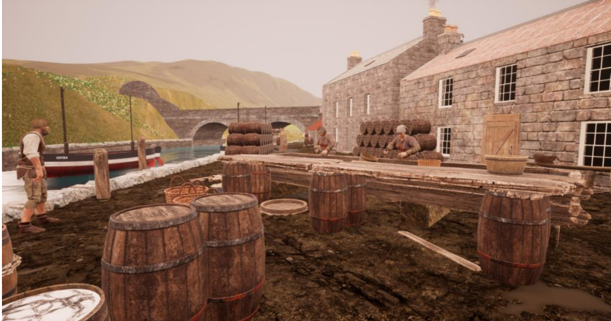
Screen capture from the Helmsdale reconstruction (Open Virtual Worlds)

Helmsdale Fishing Village DOI: 10.5281/zenodo.4642406