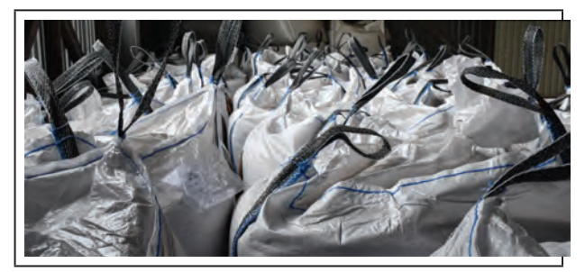
8. Organic wheat stock in companies' warehouse