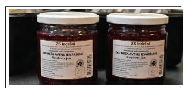
2. Organic raspberry jam