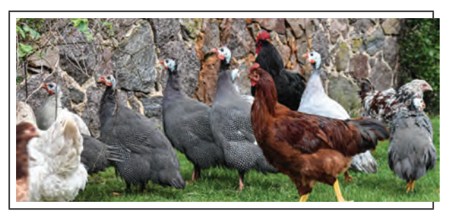
15. Organic chicken and guinea fowl