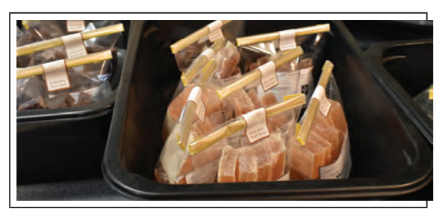
3. Organic linden flower and rye bread jellies