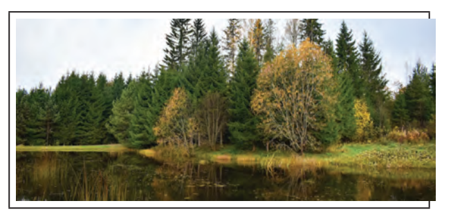
1. Beautiful landscape of farm "Indrāni"