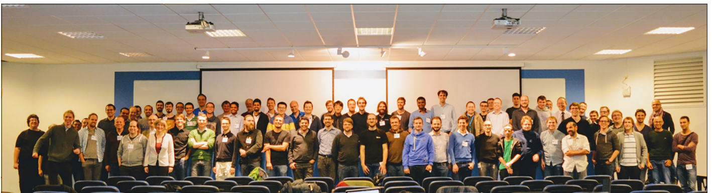
Figure 2: Group photo of OrConf2015 in CERN, Geneva. One of the key milestones of OSH.

At around the same time RISC-V started to have a noticeable impact. Developed by UC Berkeley, on its own RISC-V is not directly OSH. But the instruction set architecture (ISA) provided a contract between the software and the underlying hardware that was fresh, clean and was made openly available. A well accepted ISA is impor-