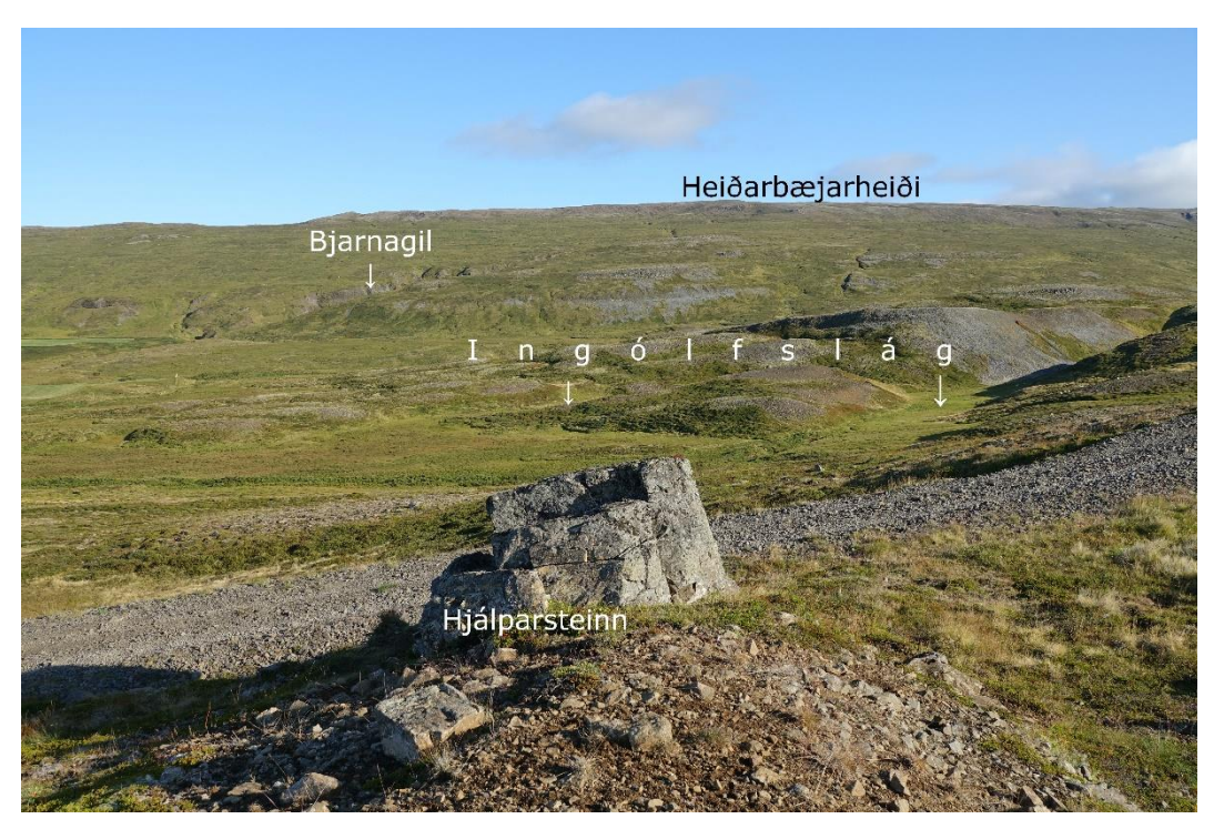
Fig. 9: Heiðarbæjarheiði with Bjarnagil, Ingólfslág, and Hjálparsteinn. Ingólfslág is a horseshoe-shaped hollow encircling a hill; the arrows mark its two ends on both sides of the hill. Note the close clustering of places connected with the story which is found here, but not in other locations.