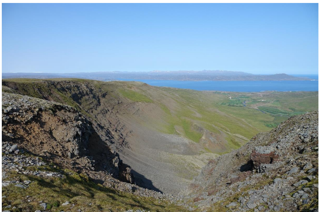
Fig. 1: On Heiðarbæjarheiði, looking along the cliffs on the eastern side of the ridge towards Steingrímsfjörður. On the right, the valley of Miðdalur.