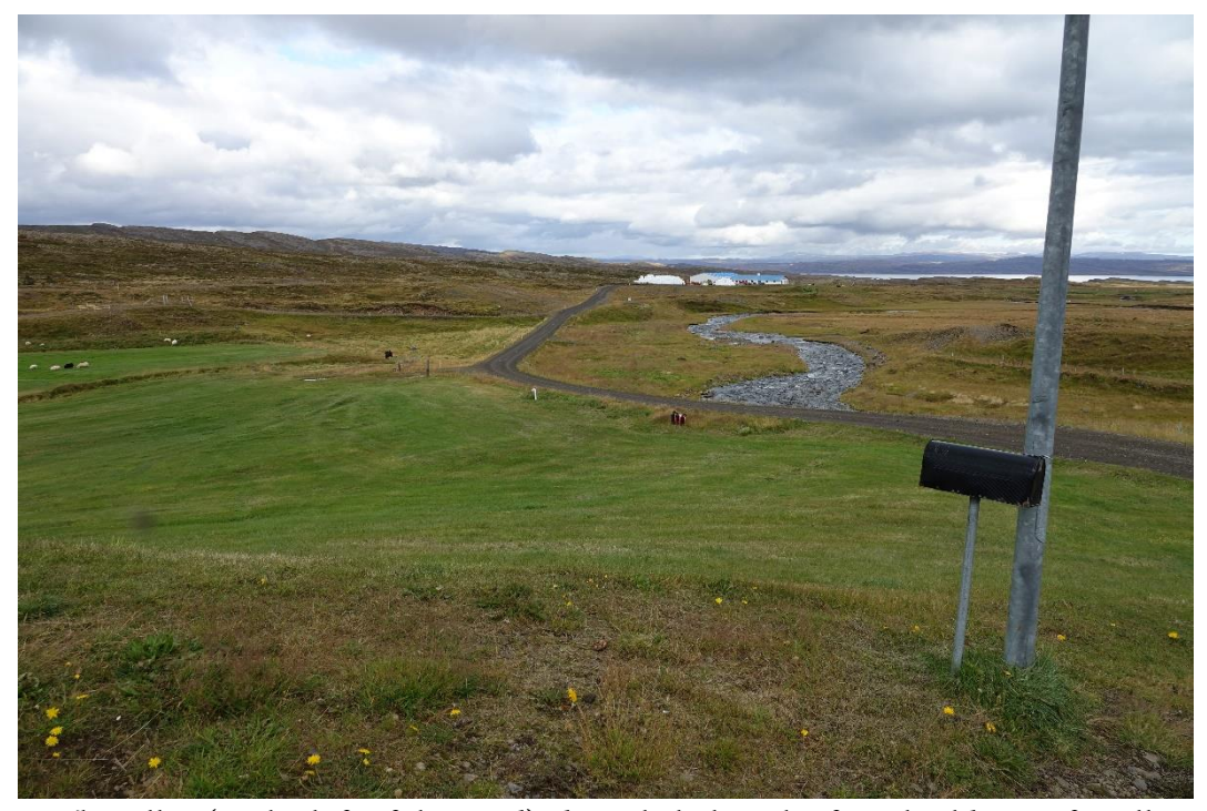
Fig. 8: Eiríksvöllur (to the left of the road), directly below the farm buildings of Tröllatunga.