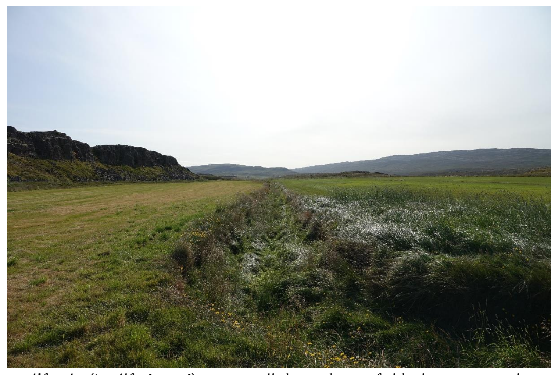
Fig. 2: Hrólfsmýri ('Hrólfur's Bog'), now a well-drained grass field.