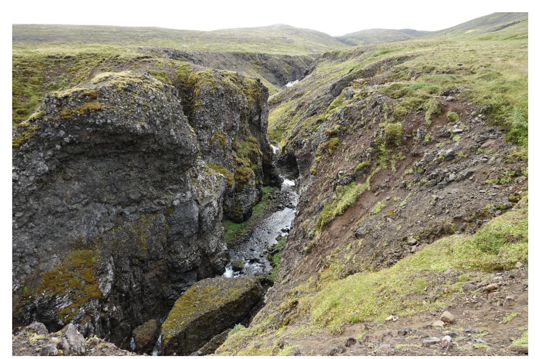
Fig. 4: 'They had all lost their life and some were found in Halldórshvammur ('Halldór's Grassy Hollow') and Pálshvammur ('Páll's Grassy Hollow'). There, there are deep and fantastic gorges at many places, which can be called dangerous.' One of the gorges on the way to Halldórshvammur.