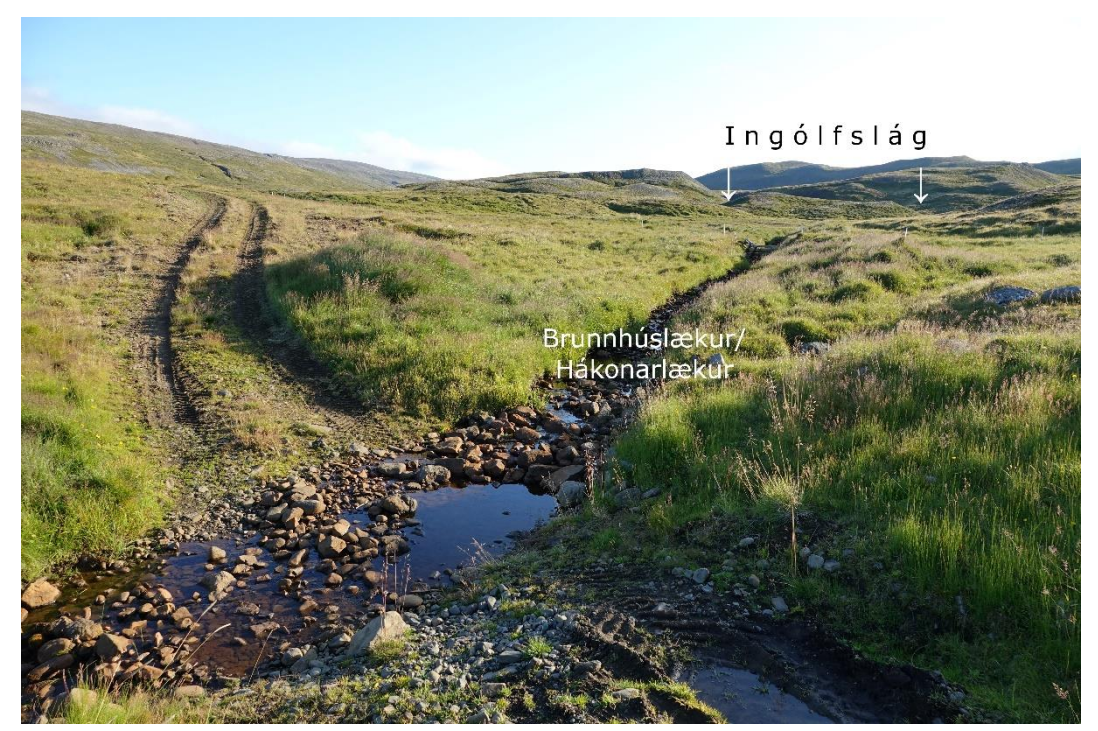
Fig. 7: Brunnhúslækur (=Hákonarlækur) and Ingólfslág. Note how closely some of the places connected with 'Loss of Men' cluster together.