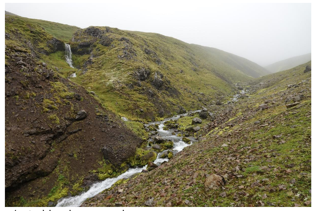
Fig. 6: Þórarinsdalur.