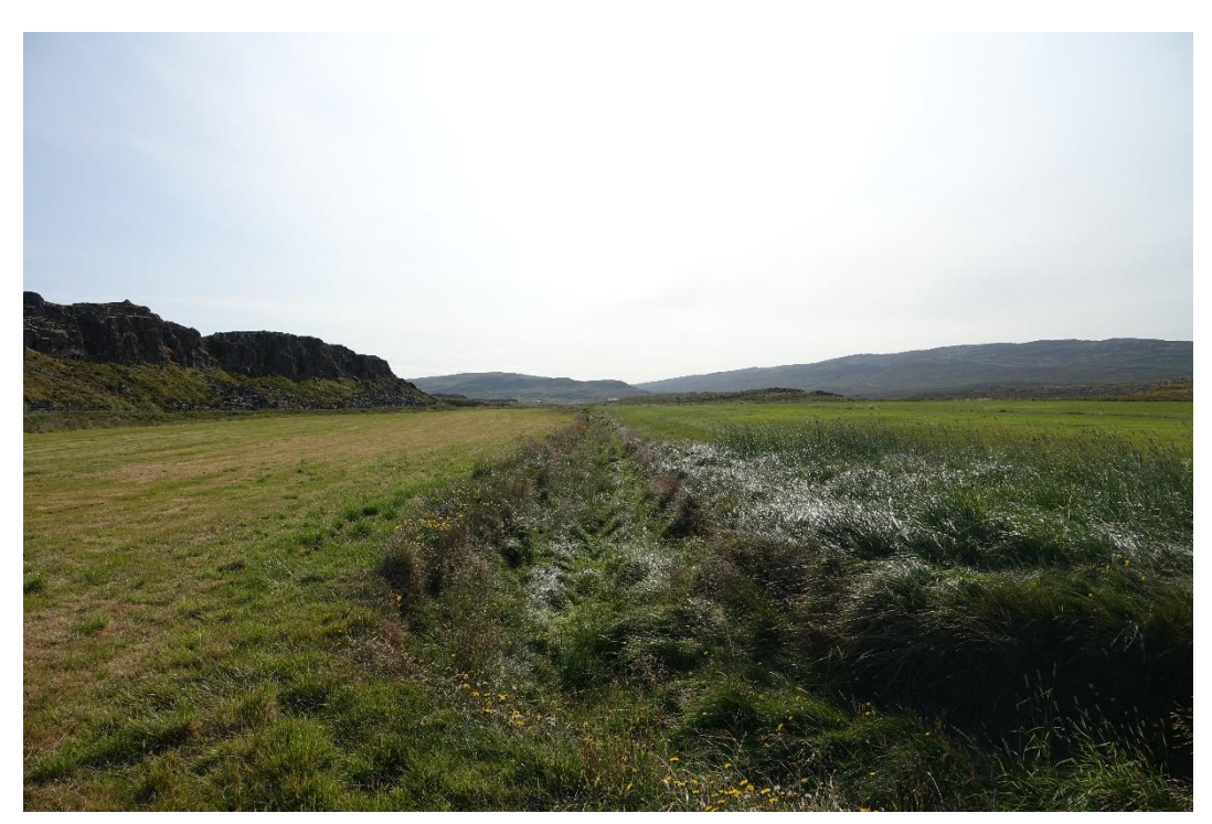
Fig. 3: The ridge of Heiðarbæjarheiði with the gorge Bjarnagil seen from the yard of the farm Tröllatunga.