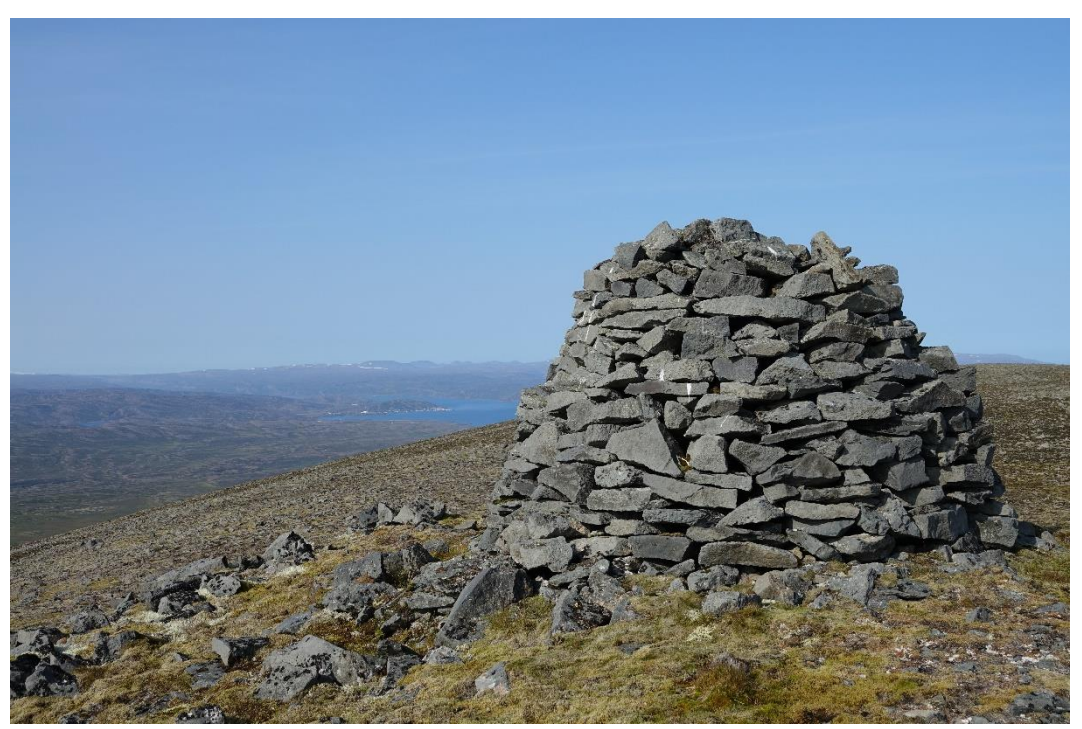
Fig. 10: The triangulation cairn erected by the Danish land surveyors in the first years of the twentieth century to mark six hundred metres elevation.