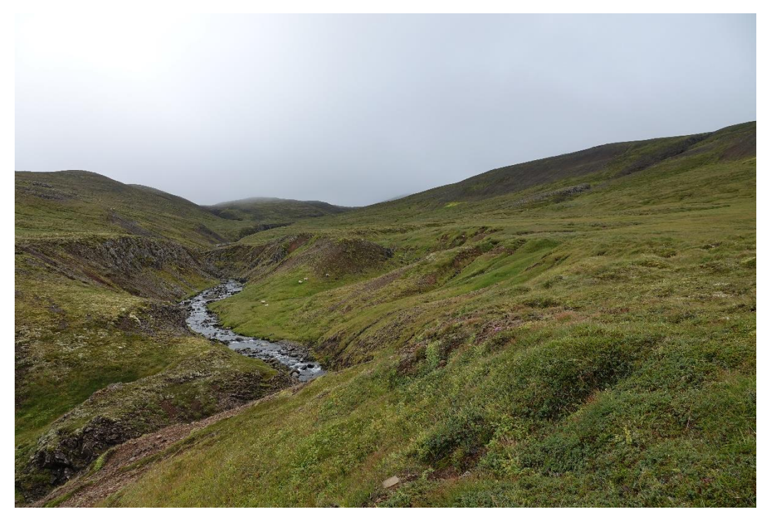
Fig. 5: Halldórshvammur. Photo © M. Egeler, 2019.