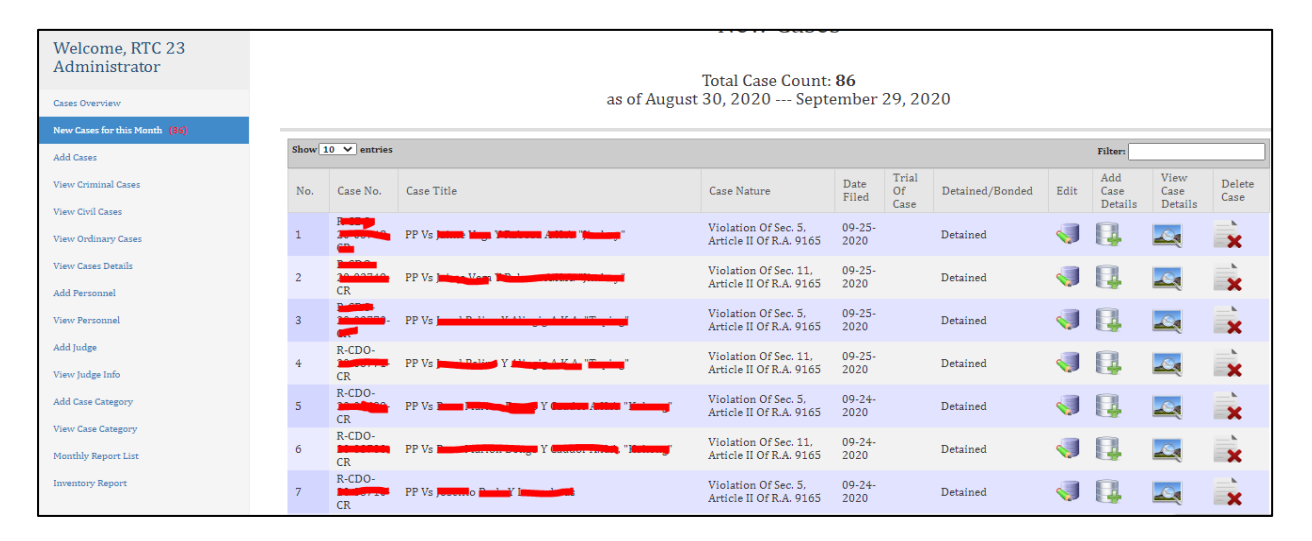
Figure 3. The Case Management Module of the CDIS.

Figure 4 shows the inventory reports used by the court branch as an attachment to their monthly reports which is submitted to the supreme court. This contains the case number, the Nature of the Case, date that the case was filed, dates of arraignment, pre-trial, initial trial and submission for decisions.