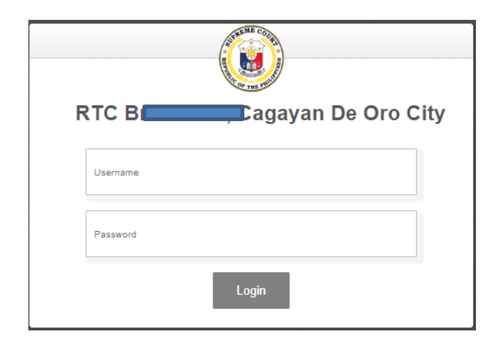
Figure 1. Login Module of the CDIS.

Figure 1 displays the login module. The login module allows authorized user for administration and case manipulation and other activities within the system, unauthorized users are not allowed to even view any cases information.