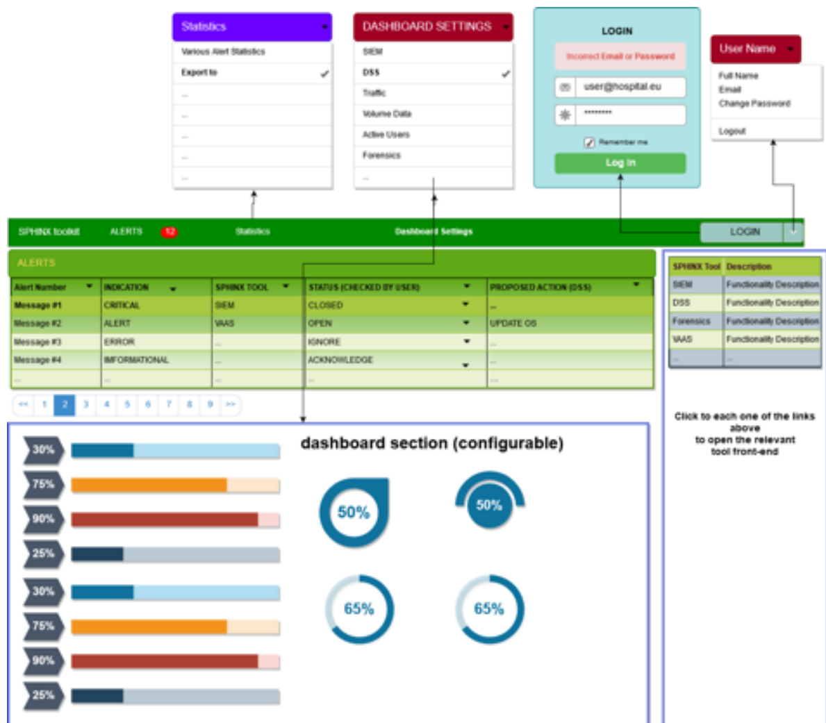
Figure 2: Interactive Dashboard Mock-up

The Interactive Dashboard enables the user to customise/configure the interface. In this way, the user can, for example, select which information to display, in which form and where.