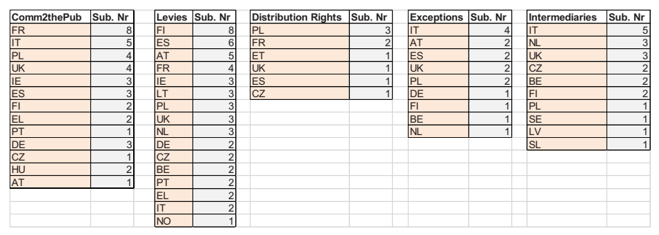
Figure 6: Repeat Players on individual Legal Concepts [Colour figure can be viewed at wileyon-linelibrary.com]

When we consider the country submissions for each of the clusters identified in the methodology section above, we have another interesting picture. Some countries, despite their overall involvement in EU litigation and their extremely high involvement in copyright litigation, are in fact interested only in a limited number of legal issues. It might be suggested that they intervene only on topics that are relevant for their domestic policy and where they hope to make an impact. Figure 6 shows the copyright submissions from each country broken down by main legal concept in the case.