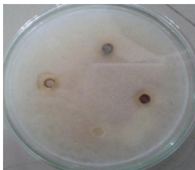
Figure 2. Antimicrobial activity screening against MRSA.

Ginger extracts R, P, L were potent against MRSA while MRSA is resistant towards J.