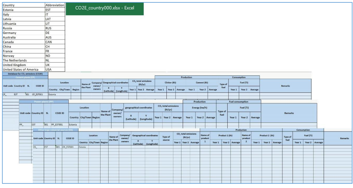
Figure 2.1: Data sheets for CO<sub>2</sub> emission sources (CO2E_country000.xlsx)

All the data must be given in maximum details using presented tables.