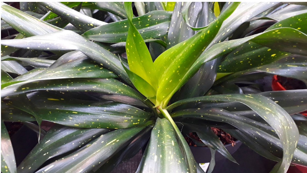
× Draviera FIREFLIES at garden center GroenRijk de Wilskracht in The Hague, the Netherlands