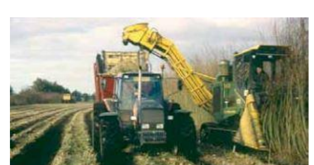
Figure 15.4 – cut and billet method

• Cut-and-billet method : Machines derived from sugarcane harvesters, such as the Austoft, are also used for harvesting willow coppice, using a cut-and-billet system. They are capable of producing much coarser chips or even chunks. The normal setting of the machine produces 5 cm chips, but by removing some of the knives and lowering the drum speed, 10 cm chip or even 20 cm billets can be produced. The advantage of the larger particle size is that the material is easier to store and dry, because the piles are much more open to natural ventilation. On the other hand, the fuel is generally not suited for small-scale boilers. The 20 cm billets have to be re-chipped before they can be used as fuel. The 10 cm wood chip could perhaps be used in large installations, if they are able to handle such fuel [15.1].