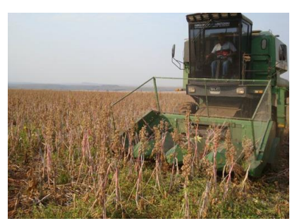
Figure 4.3 – Maize header used for castor bean

The castorbean crop is ready for harvesting when all the capsules are dry and the leaves have fallen from the plants. Ideally, harvesting should begin 10 to 14 days after the first killing frost. If killing frosts will not permit completion of harvesting before winter, a chemical defoliant may be applied 10 to 15 days ahead of the desired harvest date [4.1]. Defoliants tend to reduce yields, however. Delay in harvesting after the crop is ready may result in losses from "shattering," in which the seeds pop out of the capsules.