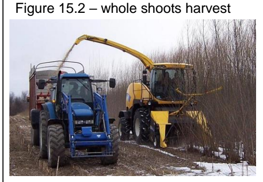
Figure 15.3 - cut and chip method