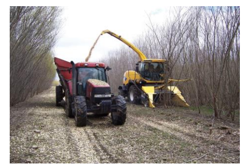
Figure 18.3 – self propelled forage harvester equipped with SRC header

No information are available on harvest solutions for Siberian elm, but studies perfemed on planting systems and biomass production rate show results that can be compared with those of other broadleaves used in SRC such as poplar and willow. For instance, authors observed that after three year cycle the number of stems per stump in differnet field conditions (soil type and water stress vs. irrigated) was between 1.6 and 3.2, while mean diameter of stems ranged from 3.5 to 5.5 cm [18.1]. The greatest diameter observed was 10.24 cm. Similar results were also observed in other studies [18.2, 18.3]. Consequently, scientists affirm that the harvest of Siberian elm can be addressed with typical machineries utilized for other SRF species [18.1].