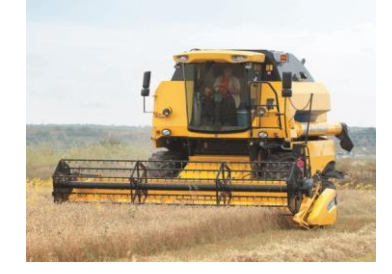
Figure 3.3 – combine with header for wheat used for crambe