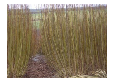
Figure 15.1 – Salix spp.