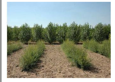
Figure 18.1 – Siberian elm