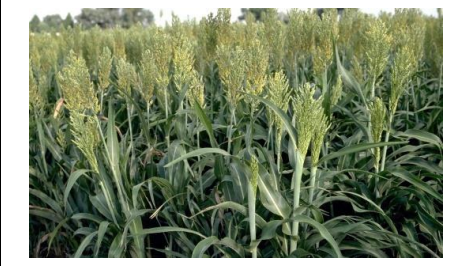
Figure 1.1 – Sweet sorghum