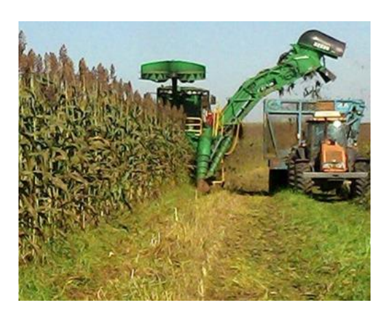
Figure 1.4 – sugarcane harvester on sweet sorghum

Sweet Sorghum (human feed, forage, biogas and 1<sup>st</sup> generation bio-ethanol)