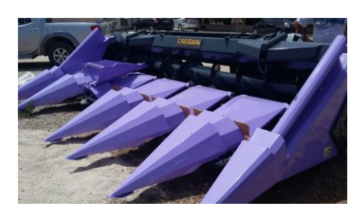
Figure 13.5 - maize header