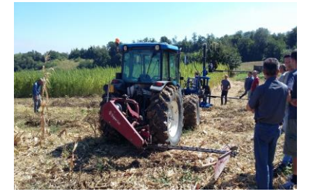
Figure 10.5 - Cutting bar to be used after threshing