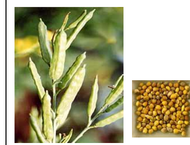
Figure 9.3 - siliqua and seeds

Figure 9.2 – wheat header utilized to harvest Ethiopian mustard