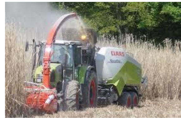
Figure 6.4 – tractor mounted Maize silage harvester utilized on miscanthus with unload directly in the square baler

Single-pass harvest with self propelled forage harvesters (SPFH) or with forage mounted machines: the biomass can be collected in a single pass using self-propelled forage harvester as verified in the project OPTIMISTIC (<u>https://cordis.europa.eu/project/rcn/101300/reporting/en</u>) or tractor equipped with front mounted or trailed machines. In case of SPFH the chopped biomass is blown into a forage wagon towed by a tractor that travels alongside the harvester. Once filled, the towed wagon travels to the side of the farm where the material is processed or prepared for transport.