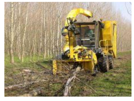
Figure 16.8 – pick up chipper for large plants (5 years old)