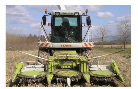
Figure 1.3 – Class Jaguar SPFH with kemper type header