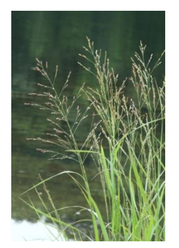
Figure 5.1 - Switchgrass