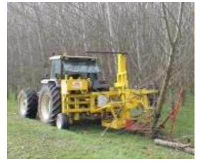
Figure 16.7 – cut windrower for large plants (5 years old)