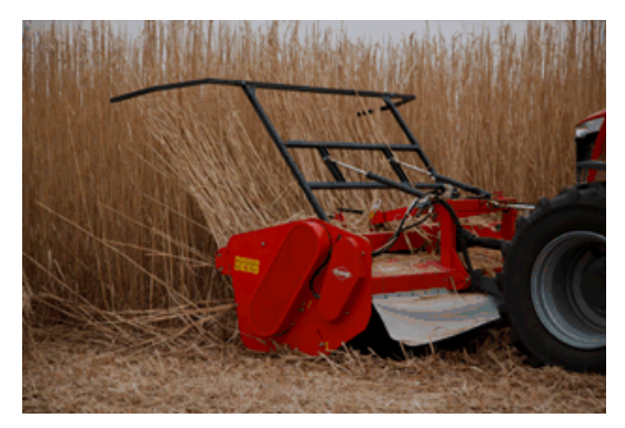
Figure 6.2 – shredder attached to the front PTO of the tractor

Harvesting of Miscanthus take place during late winter and early spring following senescence, i.e. the time when the plants lose moisture and drop the leaves that have an high silica content. A variety of conventional hay forage equipment are suitable for harvesting miscanthus, the approach can change according to the logistc of biomass chain and requests of final users, i.e. the use of bales or loose material according to the energy purpose.