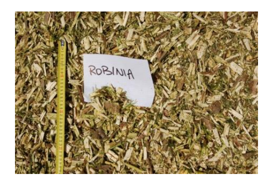
Figure 17.4 – chips produced with the Class jaguar 880

In 2014 the Claas Jaguar 880 (370 kW power) equipped with the GBE-1 header was tested in Southern Italy on a triennial Robinia plantation. The number of the knives in the chipping apparatus was reduced to 12 instead of 24. The modification had the purpose to increase the chip size produced to improve the storability of the product. The field capacity of the machine was 0,77 ha h<sup>-1</sup> and a material capacity of 38-ton h<sup>-1</sup>, similar performances were displayed in the same test on other species as Poplar and willow [17.4].