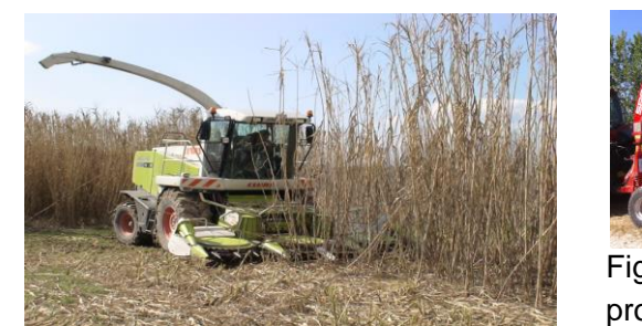
Figure 7.2 - System 1: Claas Jaguar 850 and Orbis RU 450XTRA