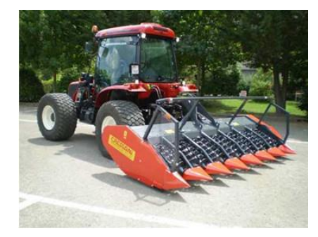
Figure 1.2 - Cressoni header

Fiber Sorghum (bioenergy from combustion, advanced bio-fuels):