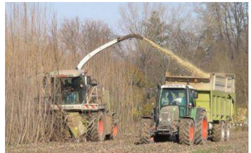
Figure 16.2 – single pass, cut and chip method

Even if conditions are carefully controlled, the storage presents some risks of significant dry matter losses. The main component characterizing the SRC harvester is the cutting head. The most important versions developed till now are Claas HS1, HS2 and GB-1, Kemper and Krone headers and GBE1 and GBE2 produced by the Italian GBE company. Various factors (soil conditions, state of the plants, wood characteristics, and plant density) affect the performance and accordingly several authors reported variable results. If the harvesting conditions are appropriate, modified foragers may allow a yield ranging (on fresh basis) from 25 to 50 tfm ha<sup>-1</sup> [16.1].