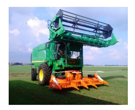
Figure 10.6 - Double cut system

The system is named Double Cut, was tested in Romania within the goals of the FIBRA project (<u>http://www.fibrafp7.net/</u>); it is a modified combine is a mod. John Deere W660 (270 kW power), equipped with a wheat-head mod. John Deere 613R in the upper part and a Kemper-type head mod. John Deere 445 in the lower part. The upper header provides the cut of the upper part of the stalks (40-50 cm) including the seeds. The lower header cut the remaining stalks in pieces of 60-70 cm length with the Hempcut technology. In this system, only the upper part is going through the combine harvester, so the volume of biomass to be threshed through the machine is significantly reduced compared to other machines used for the same purpose in the past. The threshed seeds are collected in a hopper of the machine and at full charge can be successively unloaded in a trailer. The cut stem portions are unloaded posteriorly in a windrow about 1 m wide [10.2].