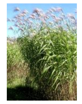
Figure 6.1 - miscanthus