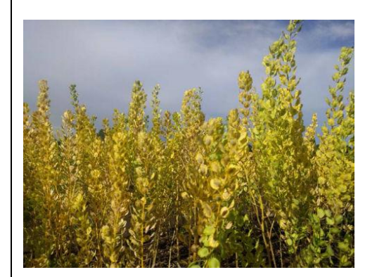
Figure 14.1 – Pennycress