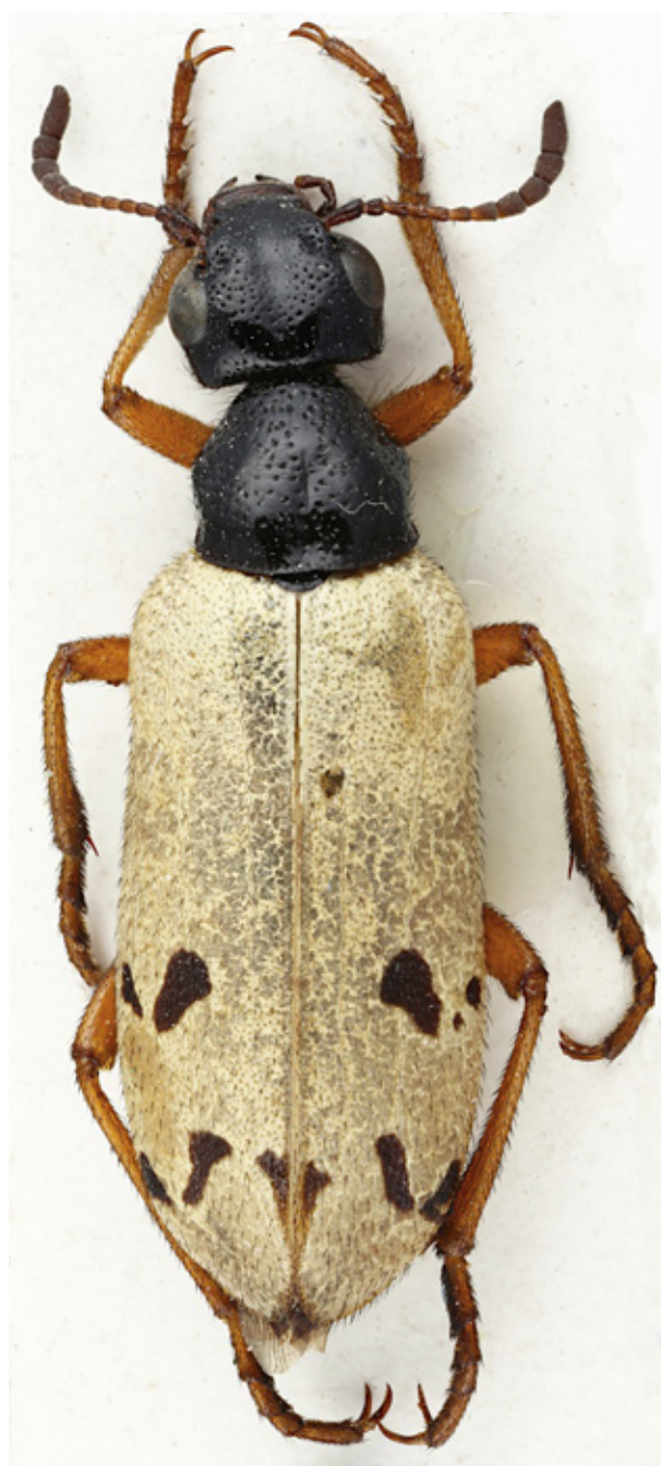
Fig. 2. Dorsal view of the habitus of Hycleus adrarensis (Pic, 1942). Specimen MNHN, Agadez Region, Arlit, Air Mountains, collected Sept. 1968.

Remark: Maurice Pic (1942) described this species from Adrar des Iforas (South-Eastern Mauritania), and noticed its close relationships with H. brunnipes (Klug, 1845). Twenty years later, Anselmo Pardo-Alcaide (1962) synonymized H. adrarensis with H. brunnipes , based on the study of a specimen identified by Pic from Agadez (IFAN collection). Only six years later, he described a new species belonging to the brunnipes -group from Sudan and Mauritania, H. kaszabi (Pardo Alcaide, 1968). All the studied specimens fit perfectly with the complete description by Pardo-Alcaide,