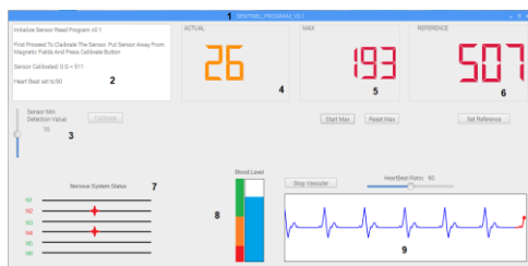
Figure 3. First version of SENTISIM user interface.

The software (virtual part of the system) collects all the data from the sensors, guides the exercise through a user interface which displays the counting of the detection probe along with its reference value and other information such as like heart beat signal, vascular circuit blood level and nerve integrity (Fig. 3). Once finished the exercise, the software evaluates the training session through performance data. Gathering information of the training and comparing over evaluation metrics is essential to measure the quality of an exercise. The evaluation metrics considers time, precision of detection, probe sweeping area, correct node extraction and accidents (vessel or nerve cut). This evaluation is combined with an ocular inspection from a supervisor.