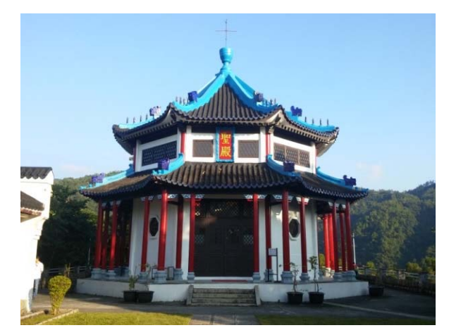
Fig. 6 Christ Temple, Tao Fong Shan Christian Center.

auspicious animals and mythological creatures, Christ Temple's roof ridge figurines (Fig. 8) represent pilgrims who come to the Christian Center to study and go out in all directions to spread the Gospel of Jesus [18, p.9].