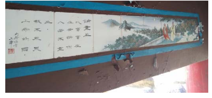
Fig. 21 Calligraphic expressions and the corresponding sections of tile paintings depicting biblical narratives.

Last but not least, to interpret Jesus's completion of his redemption of mankind, signified in his last words on the cross, "it is finished," the two characters cheng-le on the gigantic cross was rendered in Yan Zhenqing's (709-785) calligraphic style, tinged with an upright and steadfast spirit (Fig. 24).