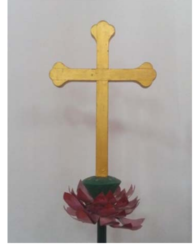
Fig. 12 A ritual wand in Christ Temple, Tao Fong Shan Christian Center.

Christian and Buddhist iconographies (Fig. 10). For instance, the bizarre union between the cross and the lotus can be seen on the altar table (Fig. 11) and a ritual wand (Fig. 12).