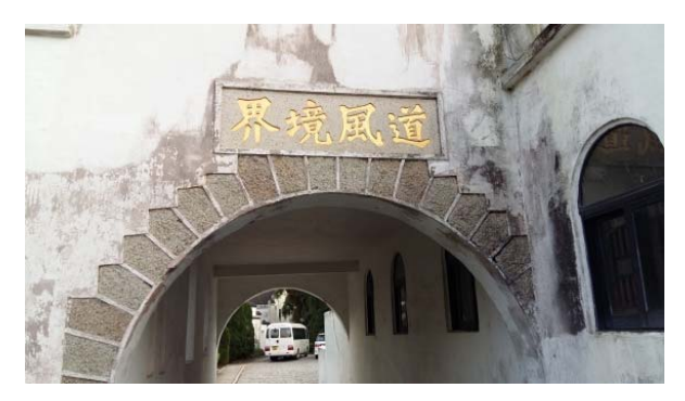
Fig. 3 Big-character calligraphy on one side of the archway to the architectural complex, Tao Fong Shan Christian Center.