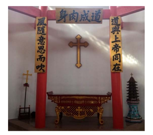
Fig. 10 Calligraphic triptych with three Bible verses.