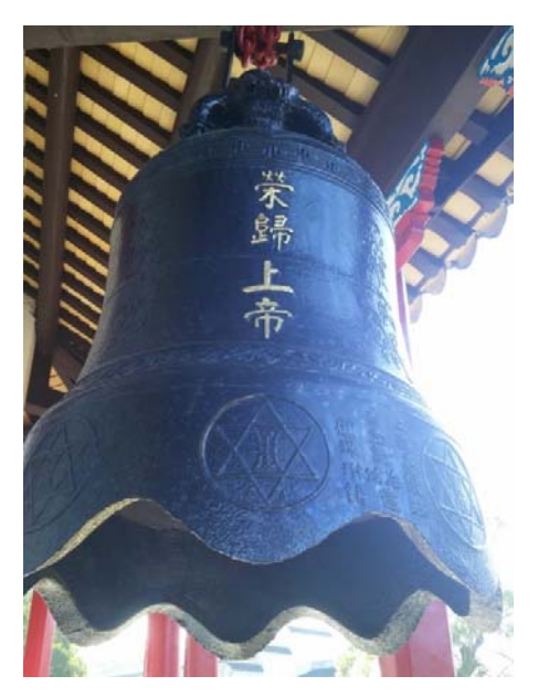
Fig. 15 Bronze bell decorated with a calligraphic inscription "Glory to God".

As a visually pleasing element, Chinese calligraphy is allpervasive in religious rituals performed in the Christ Temple. This can be illustrated by a plaque on the wall that is inscribed with the lyric of Eulogy to God the Son [Fig. 14]. When singing this hymn together, worshipers are simultaneously inspired by the magnificent calligraphy by the Reverend Zhang Zhuling (1877-1961) whose personal style of calligraphy is reminiscent of that of the Tang calligrapher Yan Zhenqing. Characterized