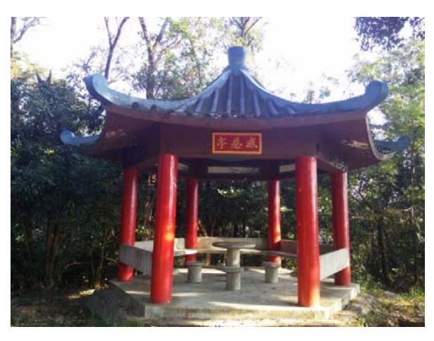
Fig. 20 Thanksgiving Pavilion.