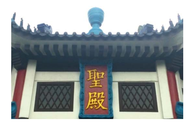
Fig. 9 The calligraphic work with two big characters "sheng-dian".

Functioning as the main space for worship, the interior of Christ Temple is adorned with major calligraphic works that reflect Reichelt's unique theology. The most eye-catching calligraphic works are placed right above the altar where major rituals are performed (Fig. 10). A golden plaque inscribed with the bible verse "The Word became flesh" (John 1:14) hangs over the centre bay, while the altar is flanked by a calligraphic couplet with two other bible verses "The Word was with God, (John 1:1) the wind blows wherever it pleases (John 3:8)." The three-fold nature of this calligraphic triptych (Fig. 10) creates a strong visual manifestation that points to the doctrine of trinity, with the "flesh" pointing to God the Son, and the "wind" a metaphor for God the Holy Spirit.