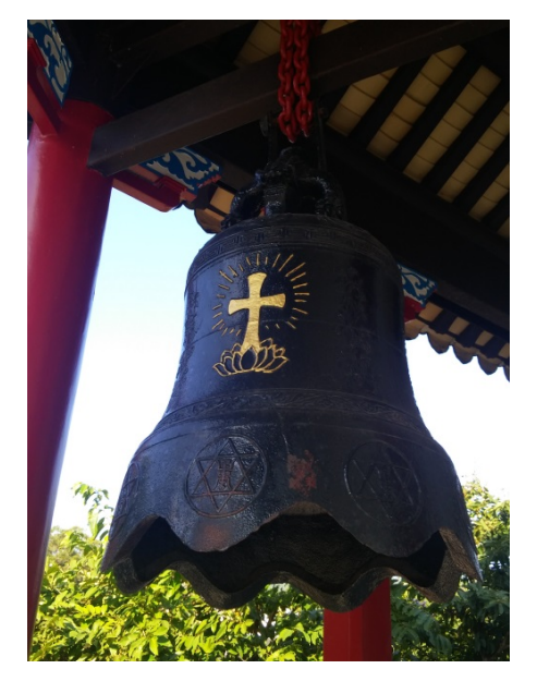
Fig. 16 Bronze bell decorated with the cross-lotus symbol.

by the upright-character composition in a broad-space arrangement, the monumental, powerful and dignified style is perfectly suited for expressing the literary content which describes major deeds of Jesus Christ's dignified life including his crucifixion as sacrifice for all mankind and his miraculous resurrection.