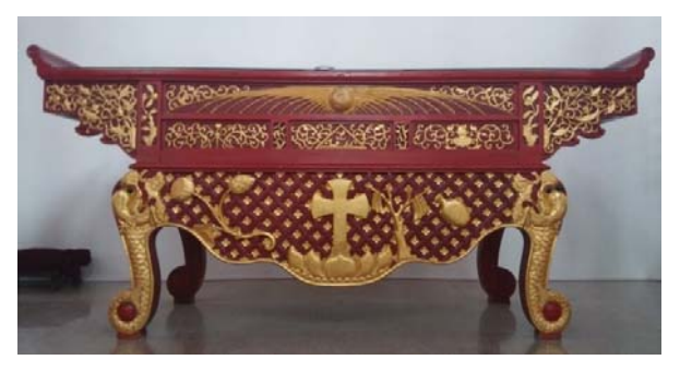
Fig. 11 Altar table in Christ Temple, Tao Fong Shan Christian Center.

In the Christ Temple, it is little wonder that the calligraphic expressions of the Chinese character tao as both a fundamental Christian doctrine and an Asian religious conception are ingeniously interwoven with a thoughtful integration of