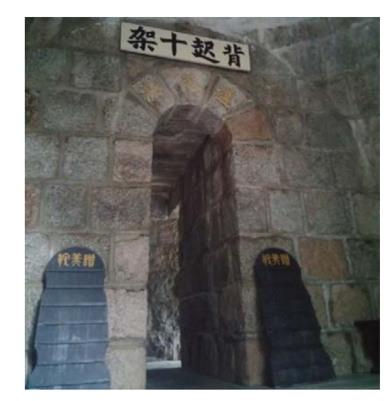
Fig. 18 Wooden plague with the calligraphic inscription "Take up the cross" above the exit of Lotus Crypt.

suitable for expressing the idea of repentance followed by a renewed and upright life as opposed to the previous disorderly life. Chiseled in intaglio and painted in gold, the calligraphic work transforms into a striking sign that reflects natural sunlight from outside the entrance of Lotus Crypt. In a sense, the shimmering calligraphic brushstrokes that glitter outside the dark cell create a telling metaphor of victory over sin. Thoughtfully designed, the small cell accommodates only one person practising prayer on his/her knees. Echoing the spirit of repentance that can be expressed by a remorseful attitude and the humble body gesture of bending or kneeling, the design of the small cell reinforces the doctrine of repentance which is simultaneously and aptly expressed in terms of calligraphic style and synergistic elements of the gold color and natural sunlight. In a nutshell, the three calligraphic works housed in Lotus Crypt are perfect examples illustrating that there is strong interconnectivity in the chosen styles of calligraphy, religious doctrines and rituals, and architectural layout designs via effective overall arrangements of architectural and nonarchitectural elements to enhance visitors' religious or spiritual experiences.