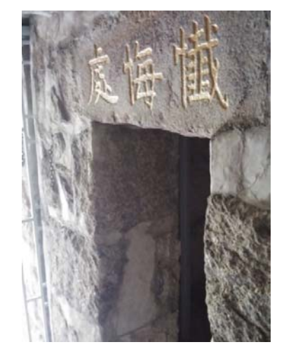
Fig. 19 Repentance place.

brushwork's airy and uplifting aura echoes with the lively lines in the human figures such as the drapery of the clothes (Fig. 22), breathing fresh life into the literary content of Jesus teaching on the doctrine of "born again".