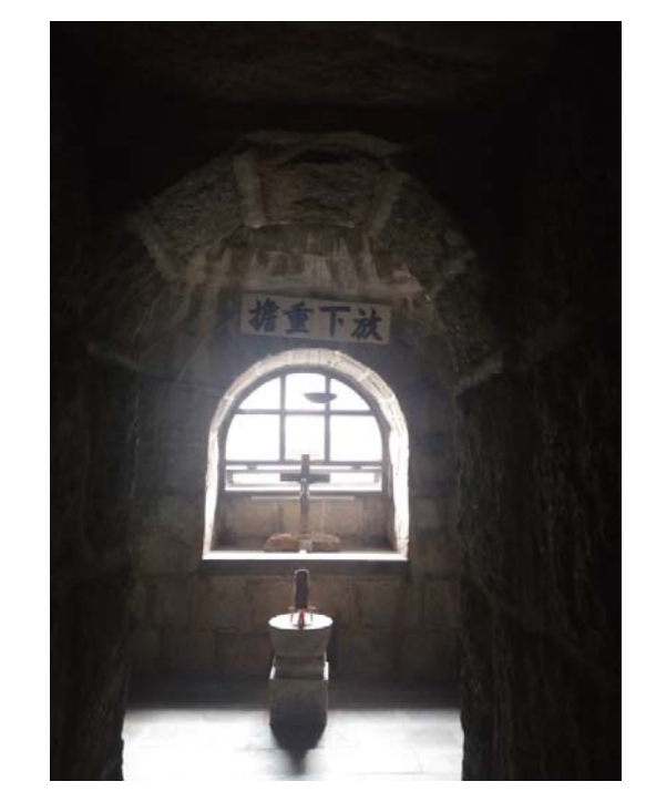
Fig. 17 Interior of Lotus Crypt with a wooden plaque inscribed with a calligraphic expression "Lay down your heavy burden".

Ringing the large bronze bell outside the Christ Temple is part of the elaborate religious ritual. The bell yields a