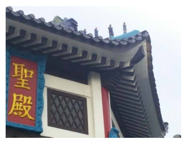
Fig. 8 Christ Temple's roof ridge figurines.

The calligraphic work with two big characters "sheng-dian"