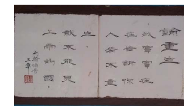
Fig. 23 Bible verses "Very truly I tell you, no one can see the kingdom of God unless they are born again". Clerical-script calligraphy as inscription of tile painting. Photography by the author