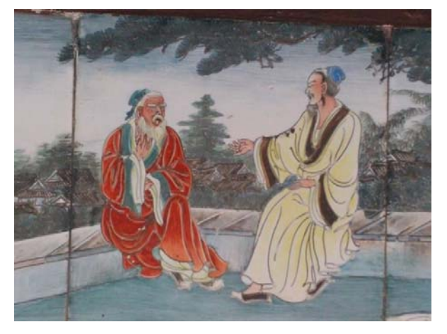
Fig. 22 Calligraphic expressions and the corresponding sections of tile paintings depicting biblical narratives with scenes of Jesus Christ dressed in traditional Chinese clothes.