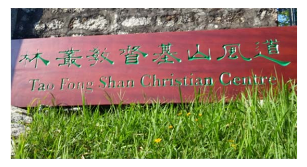
Fig. 1 Calligraphic expression of the original Chinese designation of Tao Fong Shan Christian Center.

Since works of calligraphy have been widely used to decorate Buddhist and Taoist monasteries, when seeing them non-Christian visitors might feel at home. Rendered in clerical script, this work is characterized by its squat-structured characters and the flaring horizontal and diagonal strokes. Despite the calligraphic composition's overall stability, the dramatic elongation of the horizontal and right-descending diagonal strokes offers a strong sense of movement and rhythm (Fig. 2). Moreover, the expressive effect of the brushwork is nuanced by the contrast of thick and thin at the beginnings, centers and ends of most strokes, thus furnishing an additional sense of buoyancy to the calligraphy (Fig. 2). In a sense, the overall brushwork's fluidity is flamboyant enough to be likened to the mobile nature of the visitors who are mostly Buddhist pilgrims and other spiritual seekers and wanderers participating in the Center's residency program.