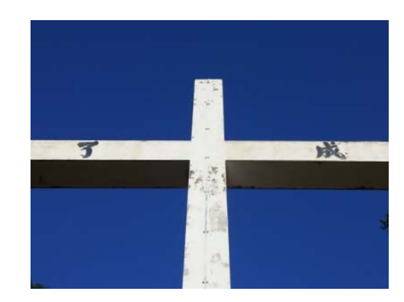
Fig. 24 The gigantic cross overlooking the Shatin valley with calligraphic inscription "it is finished,"