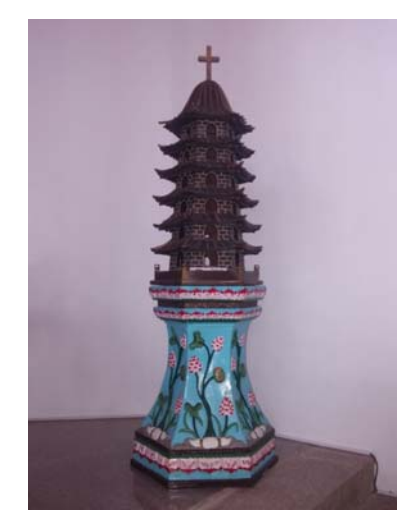
Fig. 13 Baptismal font in the form of a cross on a six-tiered pagoda.

Lotus is traditionally used as a symbol of purity and enlightenment in Buddhism. Hence the symbol of an integration of the lotus and the cross has been used as the official symbol of the Christian Mission to Buddhists, and it repeatedly appears in the Center's various published books, magazines and articles. Another Buddhist element can be seen in the baptismal font in the form of a cross on a six-tiered pagoda (Fig. 13). This purposeful combination of Chinese religious and cultural symbols with Christian doctrines and iconography vividly strengthens the calligraphic plaque's literary content "The Word became flesh", and consequently reinforces Reichelt's theology of Christ as the Eternal Logos for people from different religious background (Fig. 10). Meanwhile, the big golden cross on the wall at the far end of the aisle is obviously the most important focal point for worshipers