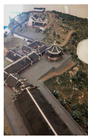
Fig. 5 Architectural model of Tao Fong Shan Christian Center, 1:200.

Coinciding with Karl Reichelt's vision to develop contextual Christian spirituality in Chinese arts and culture, Christ Temple (Fig. 6) was designed with traditional Chinese architectural elements. The octagonal structure with a double-eave pointed roof is reminiscent of the Hall of Prayer for Good Harvests leading to the Altar of Heaven in Beijing (Fig. 7).