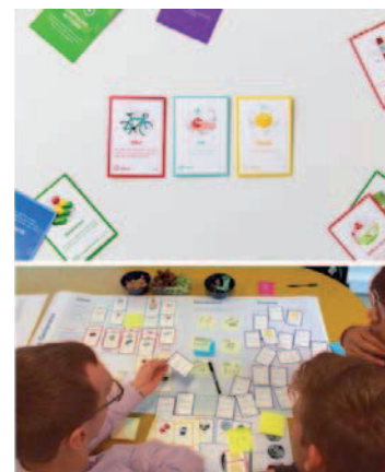
Fig. 1. Ideation Cards used in workshop setting

In brief, the design workshop consists of two main phases, the first one being an introduction both to IoT and to the design challenge (i.e. the workshop structure). During the design challenge, students work collaboratively in small groups to create an IoT-infused design solution. At the end of this phase, they pitch their idea while presenting their design solution to their peers and the facilitator(s)/tutor(s). During the design workshop, students have the opportunity to creatively design IoT applications while being exposed to diverse issues around them, like IoT-related concepts, and design for IoT.