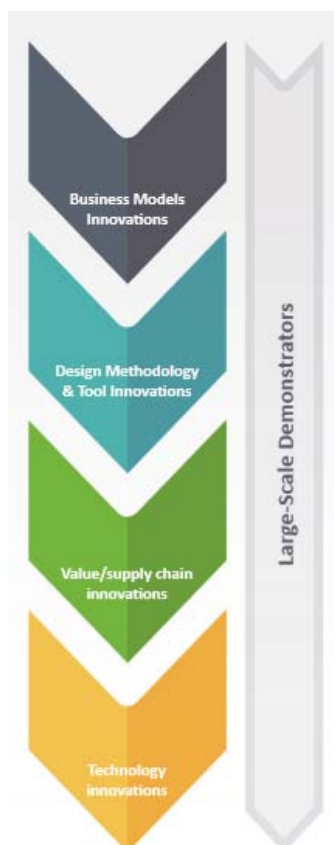
Figure 3: The work structure to be implemented in ReCiPSS.