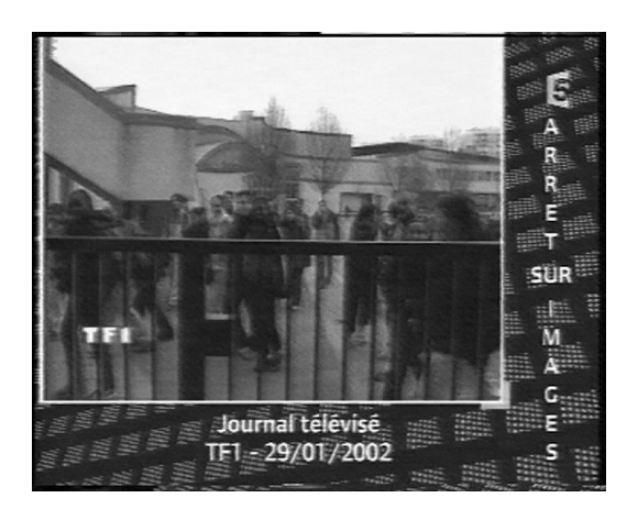
Figure 5: The schoolyard in daytime

The same place at night is depicted in Figure 6.