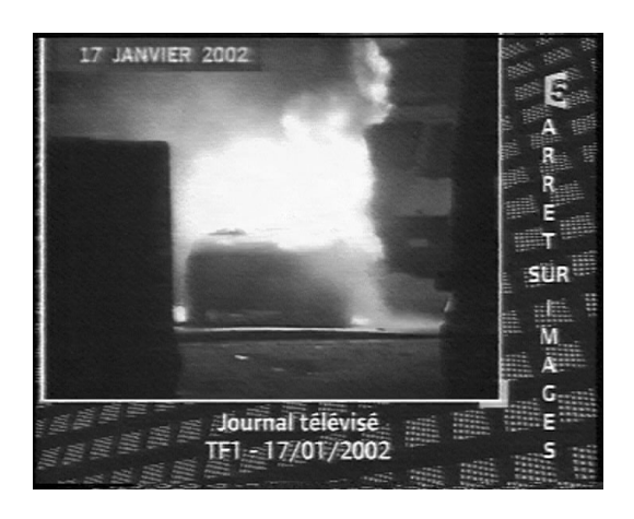
Figure 1: The Burning Car

(title versus news in brief); secondly, in the obvious abundance of pictures with a spectacular and threatening tenor in one case (see Figure 1) versus the lack of pictures for illustrating that subject in the other (see Figure 2). We may mention in passing that the way in which the contents of the news is presented in each newscast is not considered at all by the ASI's enquiry. Only obvious and noticeable differences are those ones that might be seen as 'visibility criteria' (Baccus, 1986) for an underlying pattern ASI is looking for. Its disclosing is part of the setting up of its line of argument.