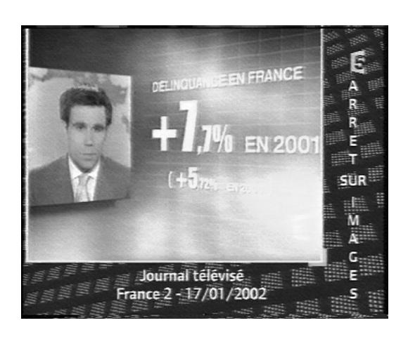
Figure 2: The AFP's Figures of Delinquency

The following sequence [B.33-43] confronts the ways the two channels have