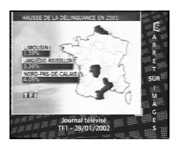
Figure 4b: The increase in delinquency in regions

Example 4 : CM and DaS; the newscasts' commentary on the official figures