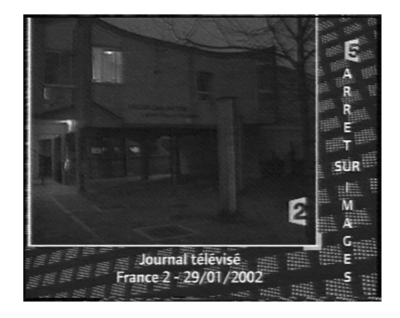
Figure 6: The schoolyard at night

The same place at night is depicted in Figure 6.