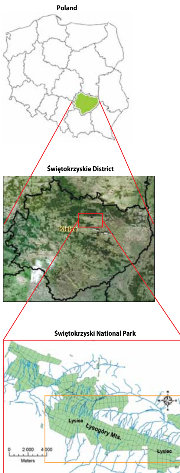
Fig. 1. Location of study area

Water samples from springs were collected over the vegetation season in 2010 during three measurement rounds: after snowmelt (30 March–3 April), after intensive rainfall (27–31 May) and after rainless period (21–24 August). For chemical analyses and statistical tests there were taken into consideration only waters from the springs active in all three measurement