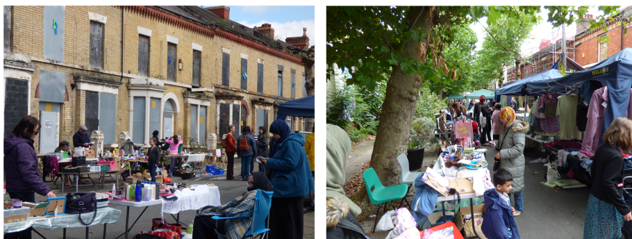
Figure 3: Granby Four Streets market

Indeed, this has attracted the interest of other creative types in the area. The Northern Alliance Housing Cooperative (NAHC)—a small group of idealistic young professionals, designers, and postgraduate students living locally and looking for empty homes to retrofit into mutualised eco-homes—was established in direct