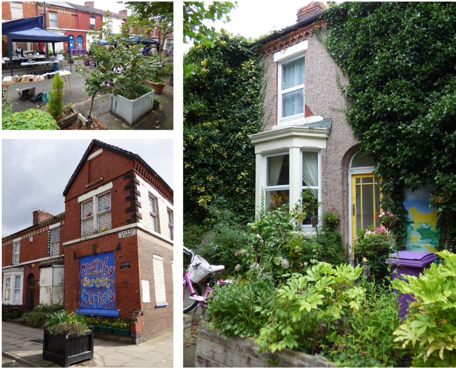
Figure 2: Green Triangle guerrilla gardening

themselves—distinguished from “Growing Granby” “because we work in public space, not behind railings on private land” (activist interview 2014).