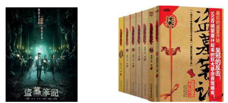
Figure 3: The Lost Tomb

This is the first seasonal online TV series in China and the adaptation by Xu Lei is scheduled to be dramatized in eight seasons, one season for each year. The first season was released in June of 2015. The novel series of the same name is about several people's adventure in ancient tombs, and it has enjoyed a wide readership since it was released online in 2006. Accordingly, the adapted TV series had been highly anticipated by its fans but turned out to be disappointing. Although there were 24,000,000 hits on the web within the first two minutes of its debut, the season was later criticized by the audiences for its weak storyline and poor quality. Some lines of the series even became jokes on social media.