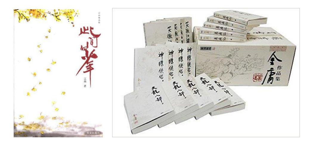
Figure 7: The novel of Jiangnan

In 2016, Jinyong sued Jiangnan for copyright infringement.<sup>29</sup> He claimed that there were too many characters' names which originated from his novels, which have earned great reputation throughout China. Furthermore, the character features and relationships were also similar. As such, there was an obvious correlation between these two works, suggesting Jiangnan infringed Jinyong's rights and benefits. Jiangnan argued that original works as protected by copyright law do not include characters' names. They also argued that the characters' relationships, personalities, backgrounds and plots of his work were different from Jinyong's works and thus not infringing any existing works.