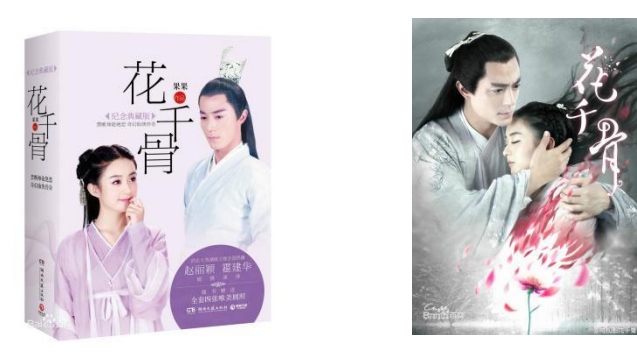
Figure 1: Hua Qiangu

adapted to the TV drama Hua Qiangu , with popular Chinese TV star Zhao Liying (赵 丽颖) and Huo Jianhua (霍建华) starring in it (depicted in Figure 1 below). The TV drama was a big hit in the summer of 2015, with the number of online plays at 12 billion only nine weeks after it was released.<sup>21</sup> According to news reports, the TV maker of Hua Qiangu , Ciwen Media, earned about 0.229 billion RMB yuan from this. Ciwen Media received 2.6 million RMB yuan from making a derivative TV drama, the Extra Story of Hua Qiangu , with iQiyi. Moreover, both Zhao Liying and Huo Jianhua became super TV stars. The games based on Hua Qiangu were also quite successful. All in all, the Super IP Hua Qiangu is a great success for the many different parties participating in it. Even the New York Times reported its success on October 29, 2016.<sup>22</sup>