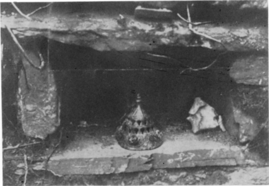
Recess in southern wall showing thurible cover found during excavation.