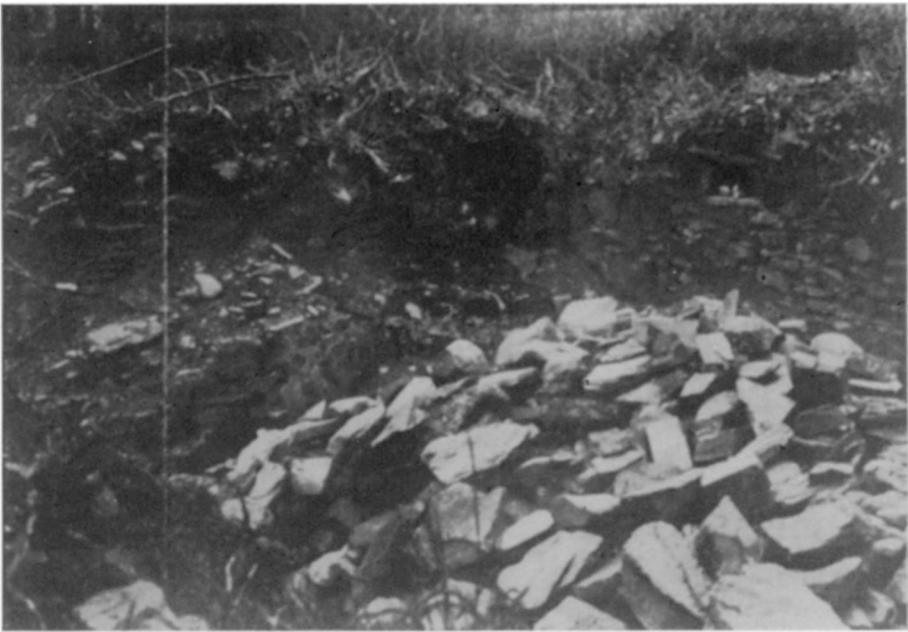
General view of east end of Church while excavation was in progress, showing position of altar. RUINS OF OLD CHURCH AT BALLYBARRACK, DUNDALK, Where Blessed Oliver Plunkett officiated.