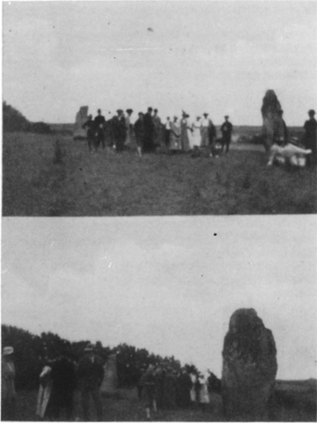
STANDING STONES AT BALTRAY