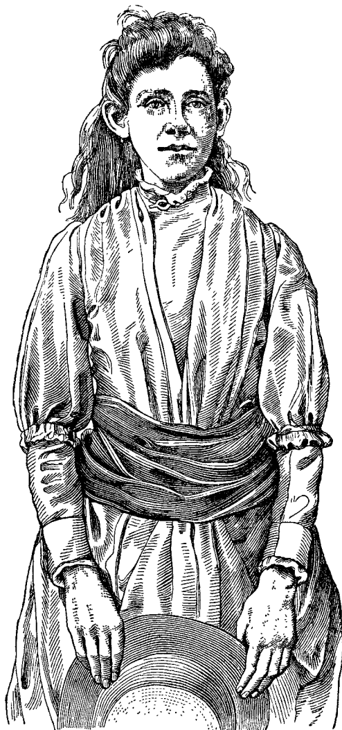
Photographed June 14th, 1887.

began, early in February, without apparent cause, to evince a repugnance to food; and soon afterwards declined to take any whatever, except half a cup of tea or coffee. On March 13th she travelled from the north of England, and visited me on April 20th. She was then extremely emaciated, and persisted in walking through the streets to my house, though an object of remark to the passers-by. Extremities blue and cold. Examination showed no organic disease. Respiration 12 to 14; pulse 46; temperature 97°. Urine normal. Weight 4 st. 7 lb.; height 5 ft. 4 in. Patient expressed herself as quite well. A nurse was obtained from Guy's,