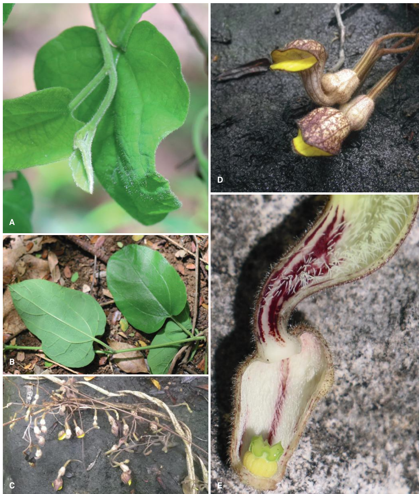
Fig. 2. – Pararistolochia enricoi Luino, L. Gaut. & Callm. A. Young shoot; B. Variable forms of the leaves; C. Inflorescence; D. Flowers detail; E. Longitudinal section of the flower showing gynostemium, utricule, and throat.