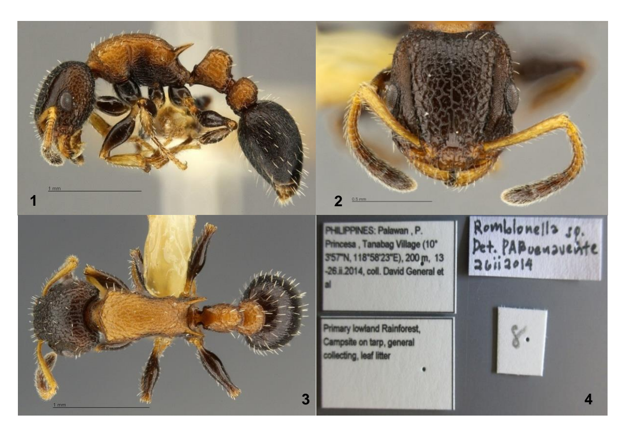
Figures 1-4. Romblonella coryae sp.n. (holotype). 1. Lateral habitus; 2. Full-face view of head; 3. Dorsal view of body; 4. Labels.

Etymology: This species is named in honor of our late former President, Corazon C. Aquino (known to all Filipinos by her nickname "Cory"), who led the country out of the dictatorship era. It is fitting that a genus named after a Philippine island has a species named after a modern Filipino hero.