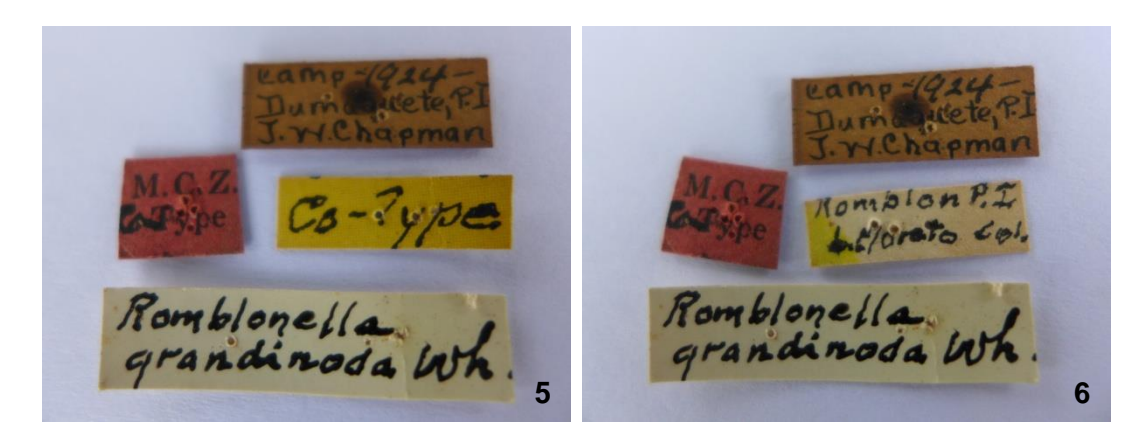
Figures 5 and 6. Labels of two specimens on a single pin, deposited at the Entomological Collection, University of the Philippines Los Baños Museum of Natural History (see text for discussion)