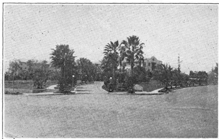
Beverly Hills Hotel, Los Angeles.

The operating company prides itself on the excellence of the service provided on both these vessels and it is the invariable statement of those who travel "the Yale and Harvard way" between California's two principle