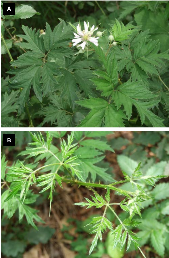
Fig. 1. Rubus laciniatus Willd.: A) general appearance of the species, B) shoot with young leaves.

vated in England (since the late 17 th century) and most probably derived from R. nemoralis (WEBER 1993).