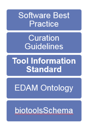
Figure 1. Technology and guidelines used by bio.tools.

These components are (or will) be described in detail in other EXCELERATE deliverable reports. In summary: