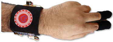
Figure 4: All three layers were joined by using self-adhesive materials because of their easy application. The displays are controlled by a 5V Arduino Nano and made wearable by mounting them on a Velcro band. To capture emotional arousal, Arduino was connected to galvanic skin response (GSR) sensor with electrodes attached on fingers to measure changes in skin conductance.

meaning: "I know what colors means but for someone else it is color coded" [P3]. They were also interested in sharing publicly positive feelings and privately negative ones: "for friends or family to know my mood" [P5].