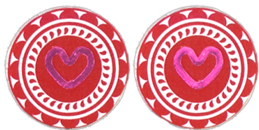
Figure 2: The Heart display involves a digitally created art design printed on adhesive tattoo paper. The design was transferred to paper and a 30–35 °C thermochromic pigment was applied at the center. A heart shaped nichrome wire was placed on polypropylene substrate. The thermochromic and heating layers were integrated with clear tattoo paper. Increase in arousal is represented by the change in heart's color from purple (left) to pink (right).

represent affective data in time-series graphs [8] which provide limited user engagement for reflection. This paper explores the feasibility of smart materials for developing novel, thin and flexible wrist-worn displays for real time visualization of affective data to better motivate reflection [10]. We report the design and evaluation of two prototypes exploiting the value of ambiguous representations of emotional intensity.