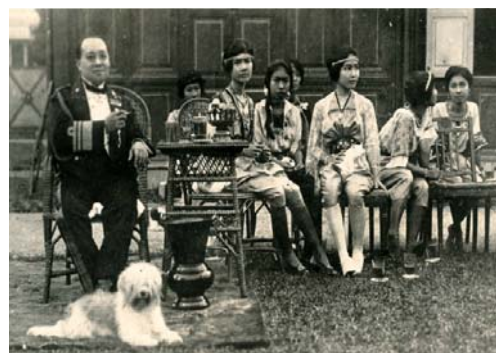
Fig. 5 Women's participation in social activity [11]

The analysis results of King Rama VI's initiation in terms of art and culture disclose the relevance of the theory of modernization especially the state of being up to date in line with western countries. For example, during the flashback of the popularity of traditional handicraft in western countries, in Thailand there was also flashback of the rehabilitation of traditional Thai art and culture to show the national identity and the prosperity of Thai culture, which has been passed on recently. In terms of the definition of culture under the conceptual framework of European Empire Period, since culture was defined as modernization or westernization, Thailand had to show its high standard of culture in accordance with western criterion by creating art and cultural artifacts based on western value and by implanting the practice of gentlemanly behavior among the citizen. Meanwhile, the support of Thai women's status in accordance with that of western countries was also implemented by the change of Thai men's misconception concerning multiple marriage life with more than one wife, the superior of Thai male over female, and the encouragement of women's participation in social clubs and formal school education.