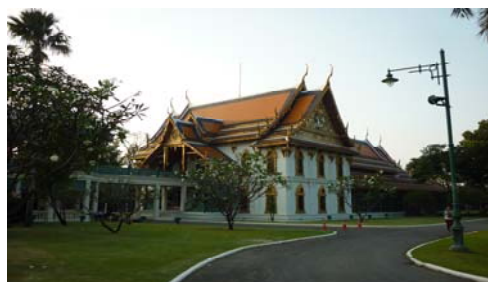
Fig. 2 The traditional Thai style building [2]

Thai art in terms of its appearance and its concept deriving from the belief of Tri-phases including planning, shape and elements. However, later on King Rama VI had an initiation to rehabilitate traditional Thai architecture and art.