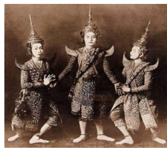
Fig. 1 The traditional Thai performing art [1]