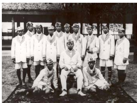
Fig. 4 King Rama VI and the football team [10]

Another activity designed to train men to have gentlemanly behavior was battle exercising and sports competition among members of the Scouts with the purpose of creating unity among members due to His Majesty's initiation about the lack of unity among civil servants [9]. The Scouts was established to serve the king's initiation to solve the problem by requiring the civil servants of all departments to come together to have battle exercises. The successful outcome of this activity was the elimination of the sense of divide among different levels of officials from different working units. Since every member had to respect commander of each level, and His Majesty was commander in chief, this resulted in the acquisition of being loyal and nationalism.