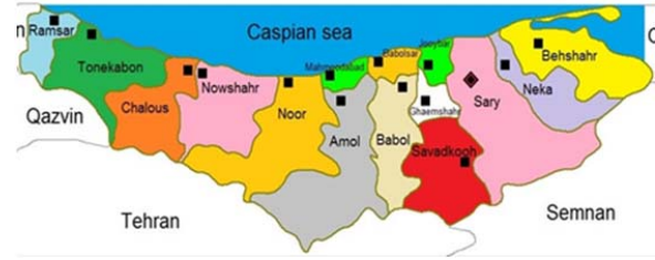
Fig. 2 Map of Mazandaran province of Iran

After solving the problem using \epsilon -constraint method, the Pareto front is achieved that the view of it is illustrated in Fig. 3 and Table IV. For this purpose, at first, we run the second objective function separately that the values F_2^{min}=349 and F_2^{max}=14938 are achieved. Also, we consider n=15 and \epsilon=0.000001 to make Pareto front.