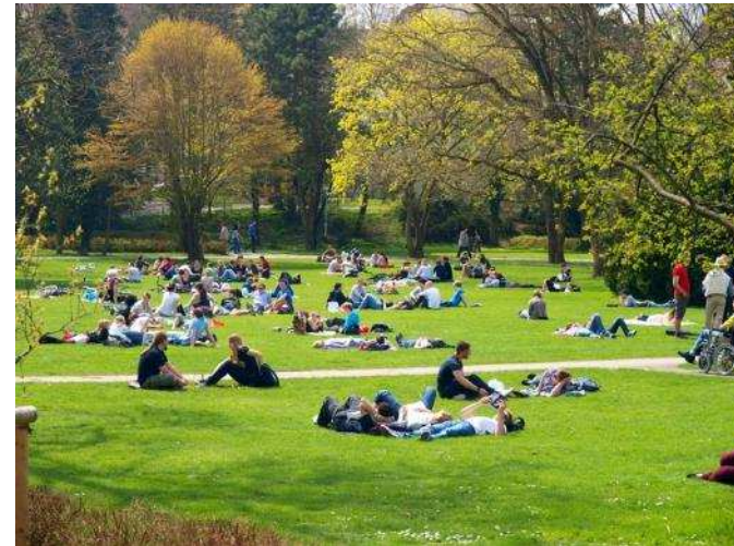
The ancient botanical garden

The Castle, Home of the Library from 1819–1912, nowadays Home of several Departments in the Humanities (Archaeology, Pre-History, Ethnology...)