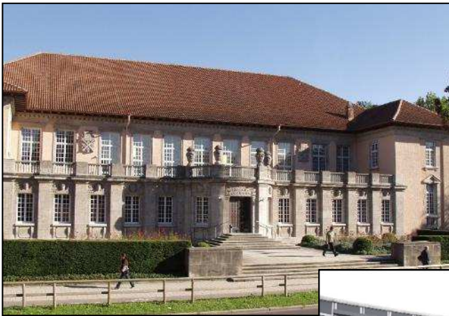
The Historical Building, 1912, Architect: Paul Bonatz