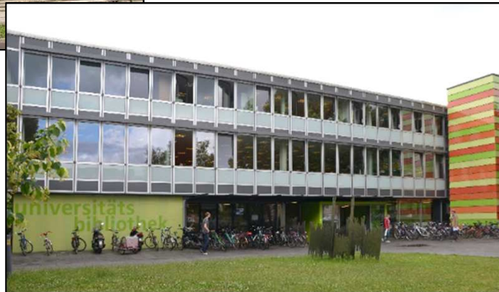
The Main Building, 1962, Renovation in 2011