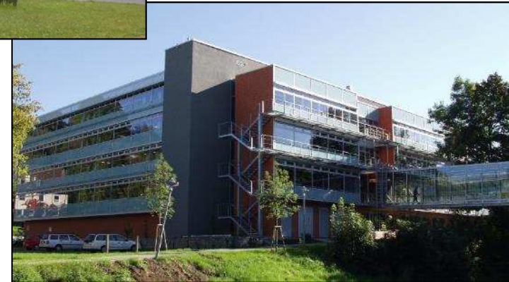
The Extension, 2002