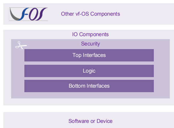
Fig 2. I/O components functionalities

The common structure followed by every IO component is shown in the next layered schema: