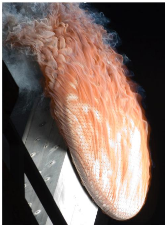
Figure 6 - Solar tower testing of 1-meter SRAM-20 aeroshell

The SRAM-20 TPS over ATK-produced structure was baselined in the ST9 Aerocapture proposal to the New Millennium Program (NMP). The detailed plan, cost, and schedule for maturing this aeroshell system to flight readiness was deemed appropriate and well-defined by the ST9 proposal review teams. Although Aerocapture was not chosen as the technology to be matured by ST9, there are plans within ISPT to implement as much of the ground development proposed for ST9 as possible. This includes manufacturing a 2.65-meter aeroshell with SRAM-20 ablator, to be instrumented and non-destructively evaluated by 2010.