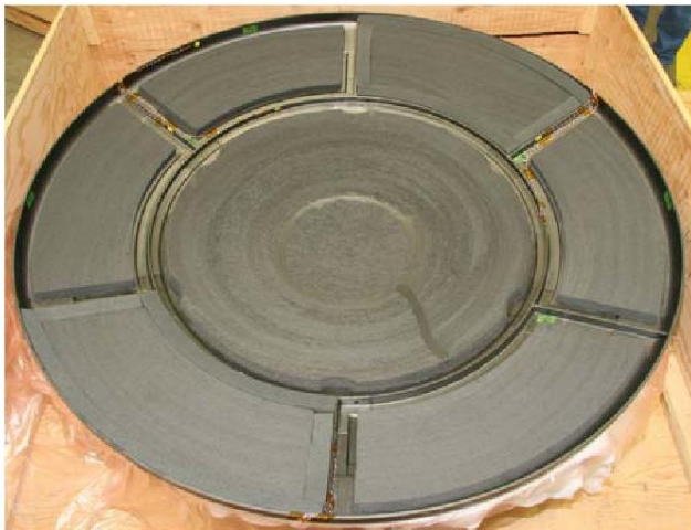
Figure 3 – Lockheed Martin 2-meter carbon-carbon aeroshell (inside view)

The second significant advancement from Lockheed is a “hot structure” aeroshell system. It is different from the traditional Mars system in that the TPS is not bonded to the front of the aeroshell; a composite structure takes the mechanical loads and heat of entry, and insulation inside the aeroshell protects the payload. The composite aeroshell, built by Carbon-Carbon Advanced Technologies (C-CAT), has co-cured ribs and stringers for stiffness (see Fig. 3). C-CAT manufactured a 2-meter diameter, 70° sphere-cone aeroshell, which was tested in a pressure bag load-test fixture to the qualification levels of a Titan aerocapture.