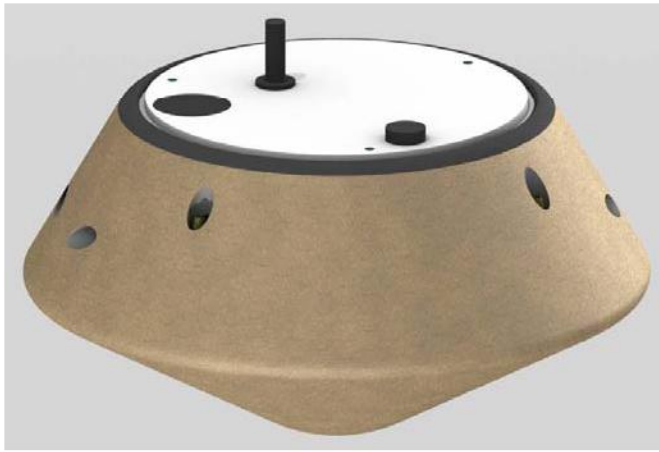
Figure 7 - Proposed ST9 aerocapture vehicle