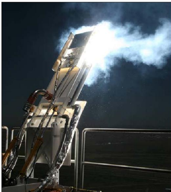
Figure 4 - Solar tower testing of flat structure/ablator panel

The culmination of the Langley, ATK, and ARA effort is the manufacture of 1-meter diameter, 70° sphere-cone aeroshells, two of which were thermo-structurally tested at the Solar Tower in October 2007 (see Figs. 5 & 6). The aeroshell tests validated manufacturing processes for a doubly-curved shape; one was an aluminum-core structure with SRAM-20 TPS, and the other was a titanium-core structure with PhenCarb-20 TPS. Data reduction is still underway, but early analysis shows that the bondline temperatures on the titanium article reached an average of 325° C, with some up to nearly 400°C. Neither of the articles exhibited any debonding, warping, or other failures as a result of the tests. Successfully accomplishing these unique, rigorous tests on large articles represents a significant jump in the technology readiness level of these systems, making them proposal-ready.