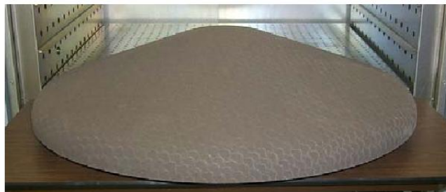
Figure 5 - One meter aeroshell ready for solar tower test

The SRAM-20 TPS over ATK-produced structure was baselined in the ST9 Aerocapture proposal to the New Millennium Program (NMP). The detailed plan, cost, and schedule for maturing this aeroshell system to flight readiness was deemed appropriate and well-defined by the ST9 proposal review teams. Although Aerocapture was not chosen as the technology to be matured by ST9, there are plans within ISPT to implement as much of the ground development proposed for ST9 as possible. This includes manufacturing a 2.65-meter aeroshell with SRAM-20 ablator, to be instrumented and non-destructively evaluated by 2010.