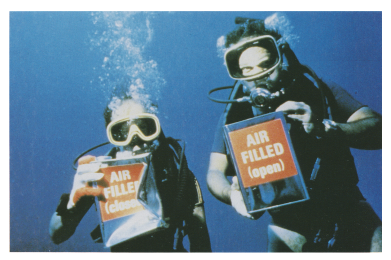
Fig. 2. Boyles law in action: the mechanism of barotrauma. The can on the right was open on the bottom to allow water to enter and equalize the pressure in the gas space on descent. The can on the left was closed and pressure equalization was achieved by collapse of the can.

out of solution and a gas phase (bubbles) will form in the blood and body tissues. These bubbles may result in the clinical entity known as decompression sickness (DCS). This disorder will be discussed further in Section VI.