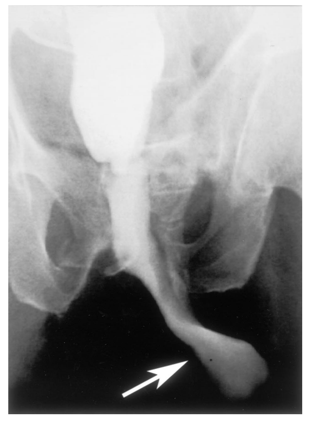
FIG. 2. Traumatic 12 cm. bladder pseudodiverticulum resolved with amputation of neck from bladder and instillation of 5 ml. fibrin sealant into diverticulum cavity.

Fibrin sealant appears to be advantageous for urological surgery as a hemostatic agent, tissue adhesive and urinary tract sealant. Unlike synthetic tissue adhesive agents, it is biocompatible and biodegradable through natural fibrinolytic mechanisms, thereby preventing inflammation, foreign body