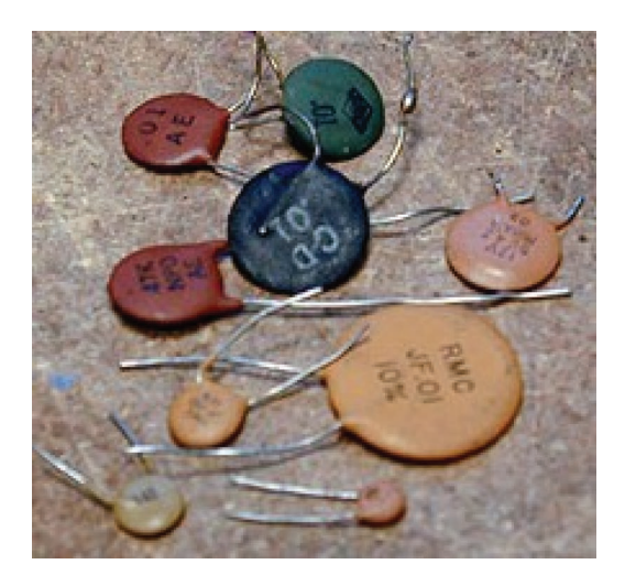
Figure 4. Examples of early ceramic capacitors taken from antique radios. Early ceramic capacitors looked very much like modern examples, although somewhat larger for a given capacitance. Then, as now, ceramic capacitors were very reliable.

Polyethylene terephthalate (PET) was patented by Whinfield and Dickson in 1941. A very strong PET, trademarked Mylar by Dupont (1952), evolved from work on Dacron in the early