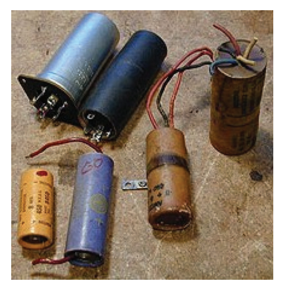
Figure 3. Examples of early electrolytic capacitors taken from antique radios. These capacitors are also unreliable and are replaced when restoring such a radio.

troduced into the telephone system. Metalized paper capacitors were very reliable as long as they were dried carefully and sealed into a dry environment. Around 1954, Bell Labs took this system a step further by separating the lacquer from the paper and making capacitors based on 2.5- \mu m-thick metalized lacquer film that were substantially smaller than metalized paper capacitors [8]. This could be the first metalized polymer film capacitor.