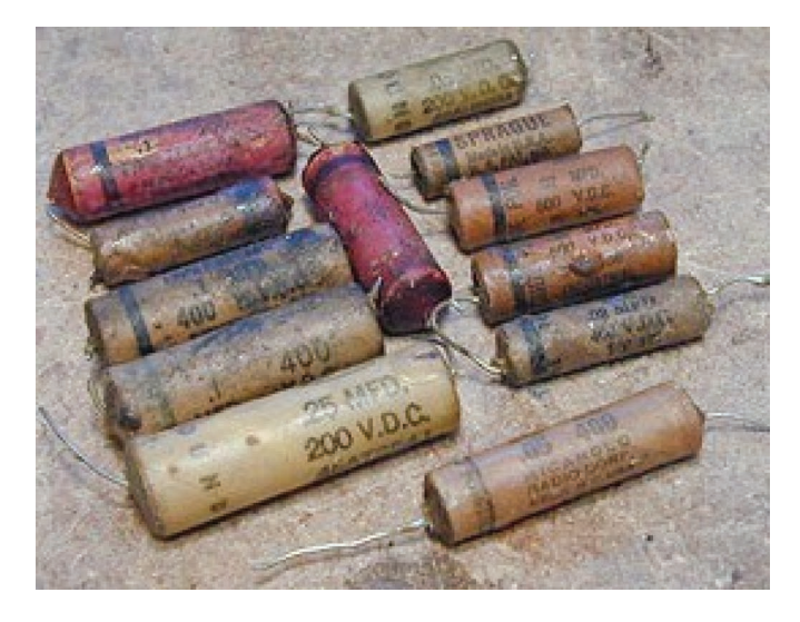
Figure 1. Examples of early waxed paper and foil capacitors taken from antique radios. Such capacitors tend to be unreliable and are usually replaced with metalized polymer film capacitors when restoring a radio.

Mica dielectric capacitors (Figure 2) were invented in 1909 by William Dubilier, with principal application in the area of radio transmission. In 1915, Dubilier founded the Dubilier Condenser Company in New York, and in 1933, the company merged with Cornell Radio to form Cornell-Dubilier Electric. From the beginning, mica capacitors, typically silver mica, have been highly reliable because mica is an excellent dielectric with outstanding discharge resistance.