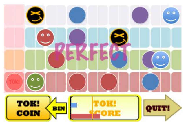
Figure 1 Play screen showing the music score grid, visual cue, the bin, coins, accuracy point bars, and a ghost coin (black) and reward coin (smiley)

Players must observe the score and tap the phone to make acoustic sounds as cued by the coins. Since they also need to move coins on the grid to change the rhythmic score for themselves and other players, the gesture for tapping is of primary importance to reduce the cognitive load. We evaluated multiple gestures for tapping and decided on holding the phone flat on a surface and tapping one end while holding the other end of the phone firm on the surface (Figure 2). The phone can be tapped on either side. This gesture allows for accurate tapping and provides better visibility of the screen.