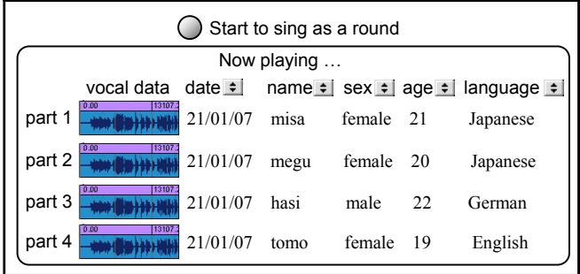
Figure 3. User interface.

If you query the database using tag data, you can make a new canon chorus consisting of your favorite vocal data downloaded from the database. For example, if you select a male as a sex tag, a male chorus is generated, and if you select a teenager as an age tag, a teenager's chorus is generated. If the exhibitions are held at multiple places at the same time, you can generate a mixed chorus with the vocal data of participants from diverse geographical locations.