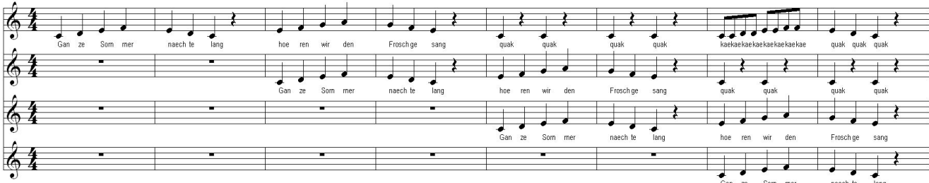
Figure 2. Score of Frog Round chorus with German lyrics.