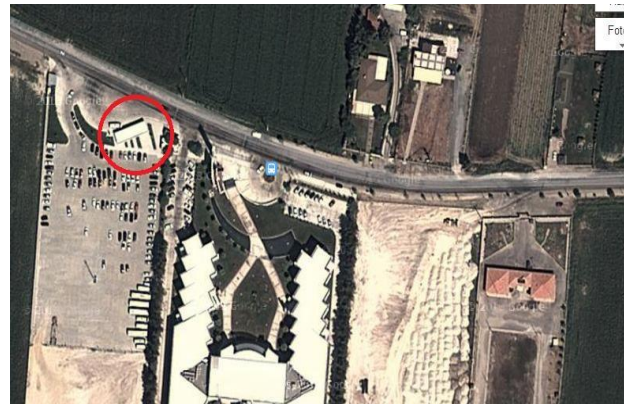
PIC 2: 2 nd RINGAREA

The university plans to solve this problem by having the existing ring capacity and waiting time of the students with the new ring system. The university will purchase a second ring tool provided that it is the same as the ring brands that the university uses.