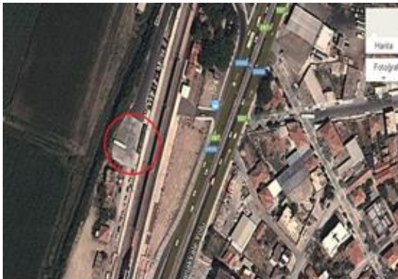
PIC 1: 1st RINGAREA

The problem is generally related to the ring systems that a university uses to carry its students to The university. The distance between the university and the locations used by the students to board the rings is about 10km. Students arrive in Ulukentring area with suburban vehicles from IZBAN. The vehicles waiting to arrive here are approximately 12 to 15 minutes away from the campus area [4].